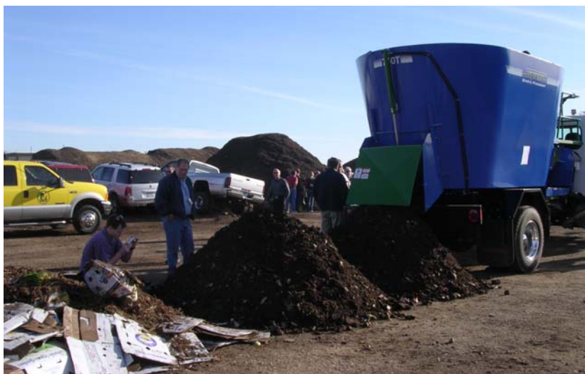
A mixer grinding cardboard and organics.

Grinding Buckets – Some loader buckets have grinding mechanisms in the bucket.