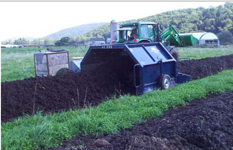
Straddle turner pulled by a tractor.

In many composting operations, a turner may be needed weekly or monthly most of the year, whereas screens and size reduction equipment are generally used intermittently and need to be stored and maintained the rest of the year. For that short window, it may not be worth maintenance and storage. As with all equipment, regular maintenance is required, and because of the corrosiveness of decomposing organic material, systems have a finite life. Some companies use stainless steel components to extend the life of the equipment.