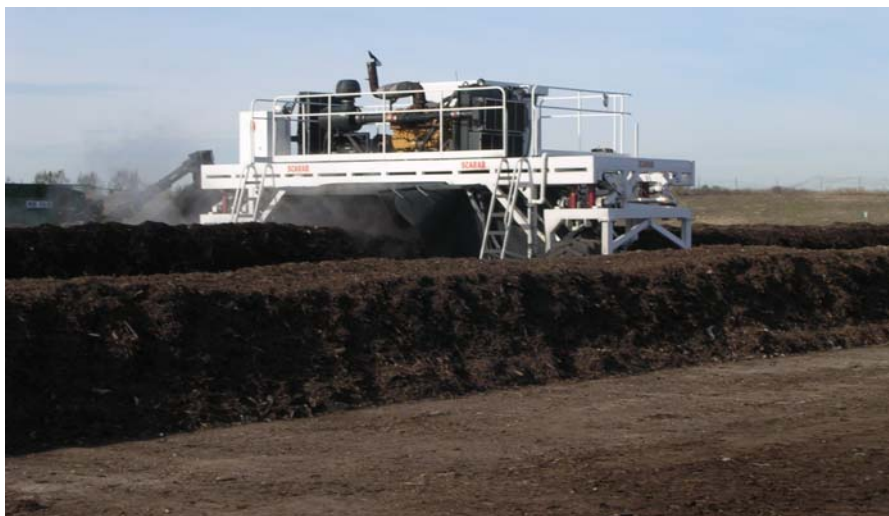
Self-propelled straddle turner.

Self-propelled Straddle Turners – These turners are generally for large facilities with five or more acres of windrows to turn. They can turn piles from 5 feet to 7 feet tall, and their larger size and horsepower allows them to turn windrows more quickly. A rotating drum shaft combined with hammers or flails reduces the size of the material and aerates and mixes the windrow. Drums on some turners can be moved vertically, which allows the operator to control the distance between the bottom of the turner and the pad surface. This is especially effective when turning dense feed stock, or incorporating additional bulking material that is laid as a base prior to pile construction.