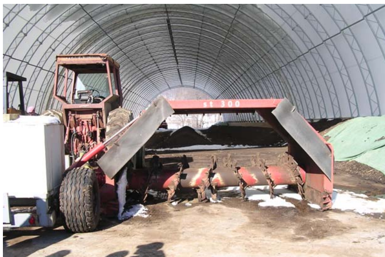
Tow-behind PTO-powered turner.

Windrow Turners – Windrow turners are dedicated pieces of equipment that just turn compost windrows. The right turner will mix, reduce particle size, homogenize the organic material and may save time and space. Turners come in many sizes and the choice depends on the amount of use, climatic fluctuations (in cold climates a bigger turner may be needed to achieve adequate pile size), and a dedicated person available for composting. Most turner