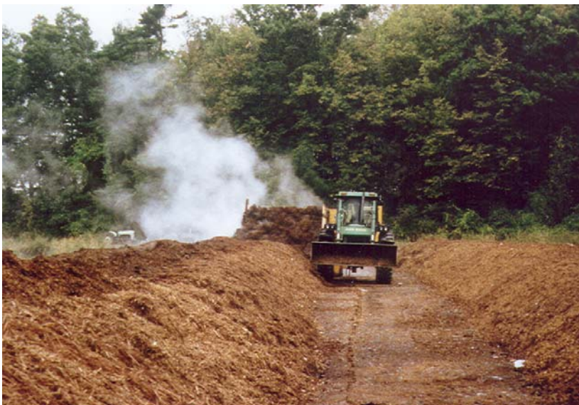
Tractor-pulled elevated face turner.

Push-type Self-powered Rotary Drum and Tow-behind PTO-powered Turners – These turners are pushed or pulled through windrows by a tractor. They are smaller than self-propelled turners. They have a rotating drum for mixing and aeration and use power from the tractor. They are designed to track on the right or left side of the windrow, and require enough space between the rows for the tractor. A tractor with a creeper gear or hydrostatic drive is required to operate these turners.