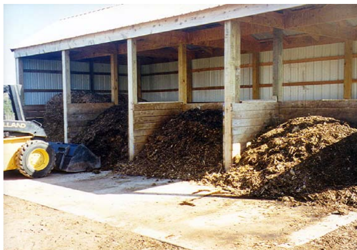
Large multi-bin system.

If using one bucket for multiple operations, it is important to turn compost from oldest to youngest and not load finished compost with a pathogen-contaminated bucket. Finished compost can be contaminated with pathogens from materials that have not been fully composted.