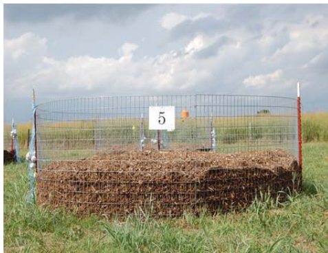
Figure 1. Compost bin with pad.

Immediately following euthanasia, each carcass was placed on the center of the pad while ensuring that the carcass remained at least 0.6 m (2 ft.) from the bin walls. Nylon hay twine was used to secure the head and legs near the carcass core. Three serum samples and 1 liver sample were taken from each carcass for SP analysis, representing time 0. Each serum sample was drawn from the contra lateral jugular and was placed in a red top vacutainer tube. A section of the liver weighing approximately 100 g was removed and placed in sealed plastic bags. All samples were placed on ice and transported to the laboratory for analysis. Two HOBO Temperature Data Loggers (Onset, Inc. Bourne, MA) were placed in each bin. One logger was placed over the front quarter while one logger was placed over the hind quarter of each carcass. The loggers were set to record temperature hourly. The carcass was then surrounded with 0.6 m (2 ft.) of additional wood chips (Figure 2). Core temperature of each pile was also recorded in triplicate using long-stem thermometers. Ambient temperature was recorded by a weather station located next to the Experiment Station.