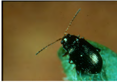
Figure 8. Potato flea beetle.