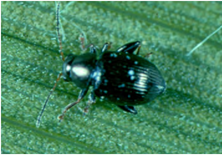
Figure 1. Corn flea beetle.