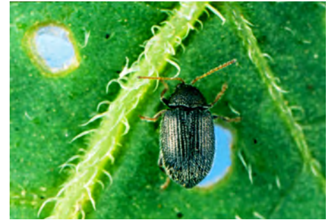
Figure 12. Eggplant flea beetle.