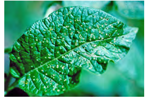
Figure 9. Flea beetle damage to potato.