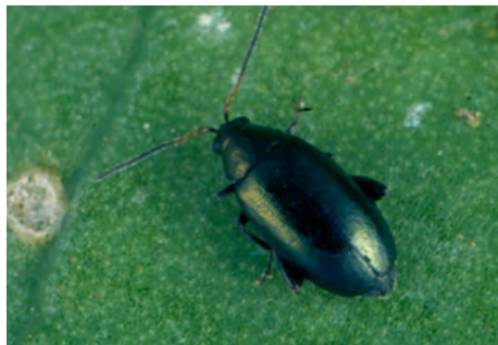
Figure 5. Crucifer flea beetle.