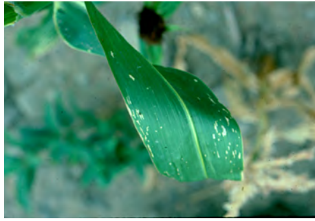
Figure 2. Corn flea beetle feeding.