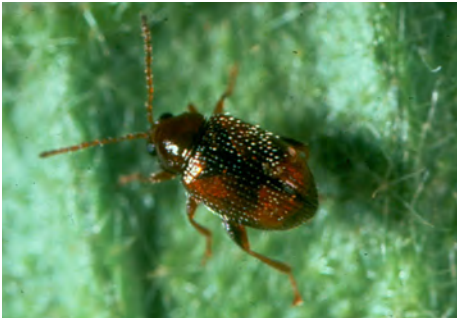
Figure 10. Tobacco flea beetle.