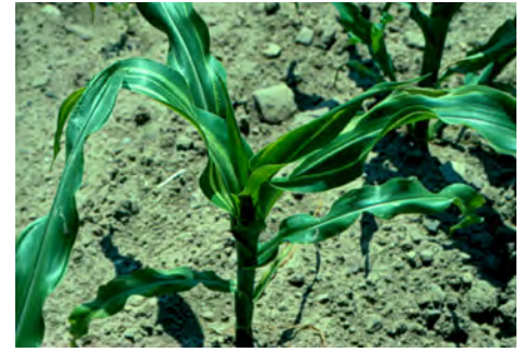
Figure 3. Sweet corn showing symptoms of Stewart's wilt.