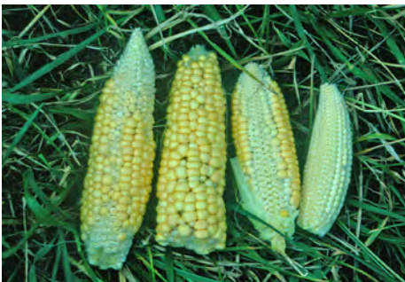
Figure 4. Ears of corn from plants infected with Stewart's wilt.

These two species are fairly similar in habits and crops attacked. The crucifer flea beetle is bluish or greenish black and 2 mm (1/12 inch) long (Fig. 5). The striped flea beetle is 2 mm (1/12 inch) long, shiny black with crooked yellow stripes on the back (Fig. 6). Both species were accidentally introduced from Europe. The crucifer flea beetle is the most common flea beetle on crucifers. The striped flea beetle is a common vegetable pest with a relatively wide host range. Both species are attracted to and stimulated to feed on cruciferous plants by the mustard oils (glucosinolates) present in the plants. In the spring, beetles initially feed on cruciferous and other weeds, then disperse to crops where they feed and lay eggs. Second-brood beetles emerge from mid-June to mid-August.