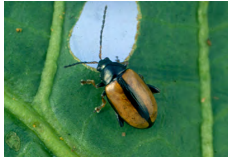
Figure 11. Horseradish flea beetle.