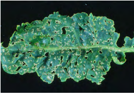
Figure 7. Flea beetle damage on crucifer.