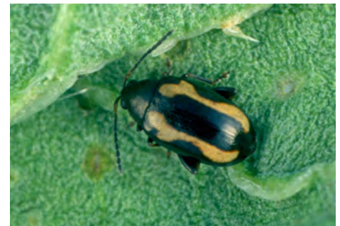
Figure 6. Striped flea beetle.