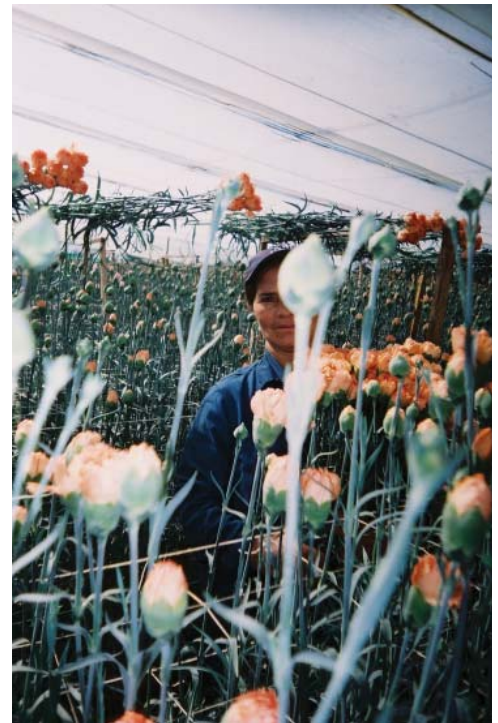
A worker in the field at a Colombian plantation.