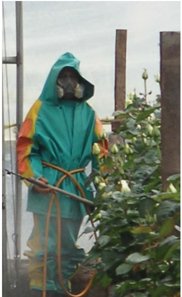
A worker spraying chemicals at a farm in Ecuador.

Genetically modified flowers raise even more questions about the effects of floriculture on human health and the environmental. In 2000, the first genetically modified flower, a blue rose, was approved by the Colombian flower industry. It contains genes derived from petunias to provide its artificial color. xxx Flower genes are now being altered genetically to make the flowers pest and disease-resistant, to increase the output of blooms and to make flowers last longer, but there is growing concern about the long-term effects of GMOs.