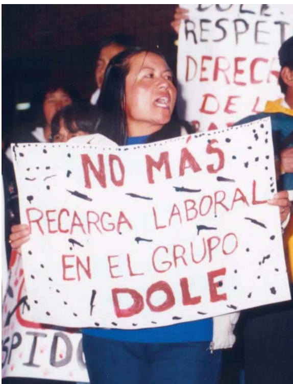
Workers protest Dole’s attacks on the worker-organized union.

A similar story is being told at Dole’s Flores de Fragancia Farm, but there is still an opportunity for the workers to prevail. Untrafragancia, the local independent union has been fighting for several years to negotiate a collective bargaining agreement, but Sintraflor, the Dole-friendly union, is Dole’s excuse to not acknowledge Untrafragancia. The union is hoping that the Colombian Ministry of Social Protection will grant an arbitration tribunal that could possibly include ILO observers to ensure a fair outcome. xxxiii