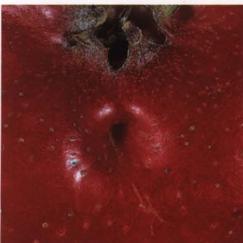
Fig. 5. Dimple on an apple caused by feeding