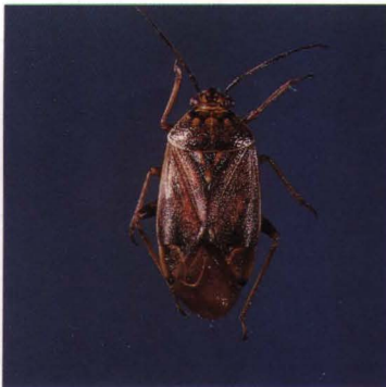
Fig. 1. Adult

Eggs hatch into nymphs about 7 days after being laid. Young nymphs are pale green and resemble aphids (fig. 3), except that their legs are more robust, their movements are more rapid, and they have no abdominal cornicles (backward-pointing structures that resemble short stems). Because the tarnished plant bug has incomplete metamorphosis, the nymphs resemble adults without wings. Newly hatched nymphs are about 1 mm (0.04 in.) long and remain greenish throughout their five stages, or instars. Nymphs in later instars turn brown and develop wing pads. They have two black dots on their thorax, two between their developing wing pads, and one in the middle of their abdomen (fig. 4).