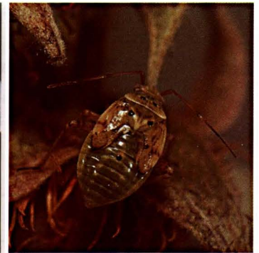
Fig. 4. Older nymph