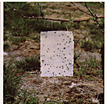
Fig. 8. White sticky trap used for monitoring