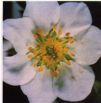
Fig. 3. Young nymph