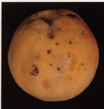
Fig. 6. "Catfacing" damage to a peach