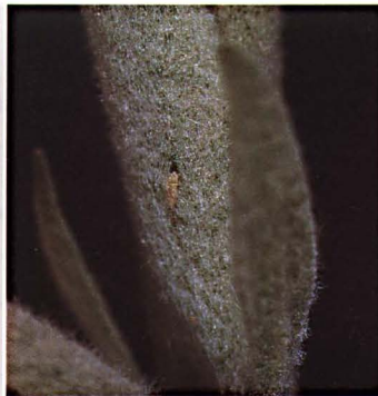
Fig. 2. Egg on a fruit bud