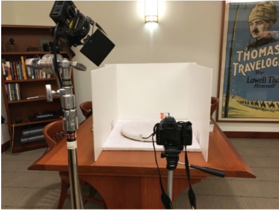
Additional setup pictures