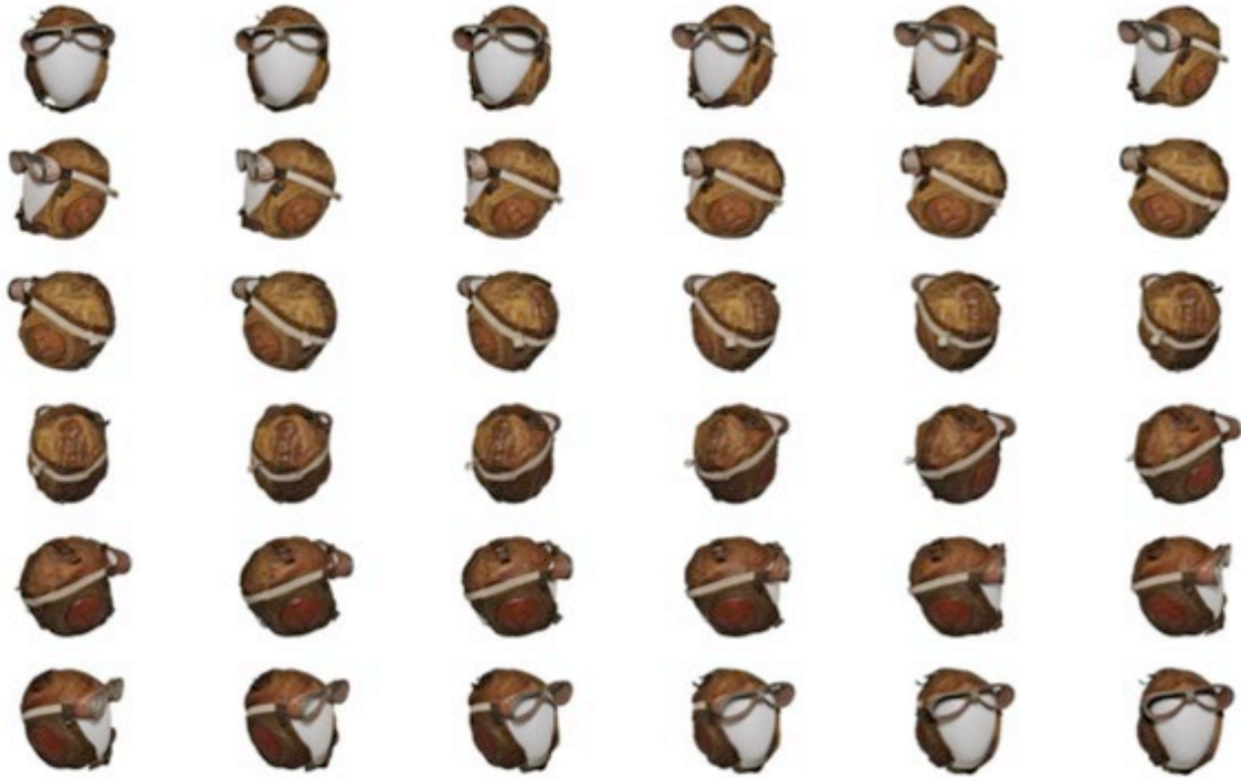
Fig 5. Stitched image of the World War I flannel-lined aviator's helmet (filename 1713-reel.jpg)

To ensure the consistency we built a custom turntable with 36 different positions each marked at 10 degree increment and used a camera stand and a wireless remote to take the pictures. The object was positioned at the center of the turntable and as we took the pictures, it was turned to its next position. We continued this process till we were able to capture 36 different images of the object each at 10-degree increment. Once the images have been captured, we removed the background of these images using the magic wand tool in Photoshop. Magic wand selects pixel based on tone and color of the image. To make the background removal process easy, we used white background while capturing the images.