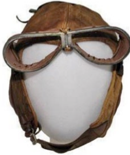
Fig 4. Initial Image of a World War I flannel-lined aviator's helmet after removing the background (filename: 1713.jpg)

As mentioned earlier, jQuery reel relies on the images of the object from 36 different angles to provide the illusion of 3D. To ensure this, it is important that the object remains still throughout the photography process. The slightest change in the position of the object or in the angle at which the images are taken will ruin the three-sixty view.