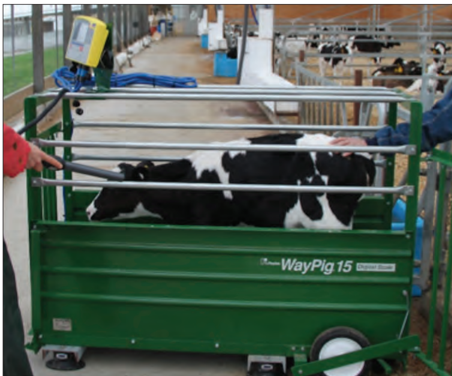
Custom weighing solution for calves.

how many times heifers will be weighed. Generally, three to four weights are needed for an accurate picture of growth and response in a herd. Common times to weigh heifers are at birth, weaning, moving to the breeding pen, and at pregnancy confirmation. Once at what age is decided, the next decision is what hardware to purchase.