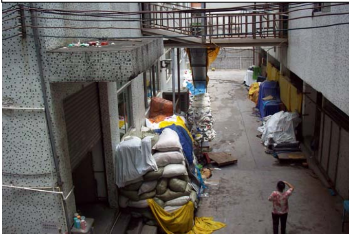
Image: The factory is unorganized and dirty, image shows Duoyuan's true color.

The work environment is very dirty and unorganized. One can see raw materials, work equipment, garbage, unfinished products and finished products piled up at random locations, including the emergency exits.