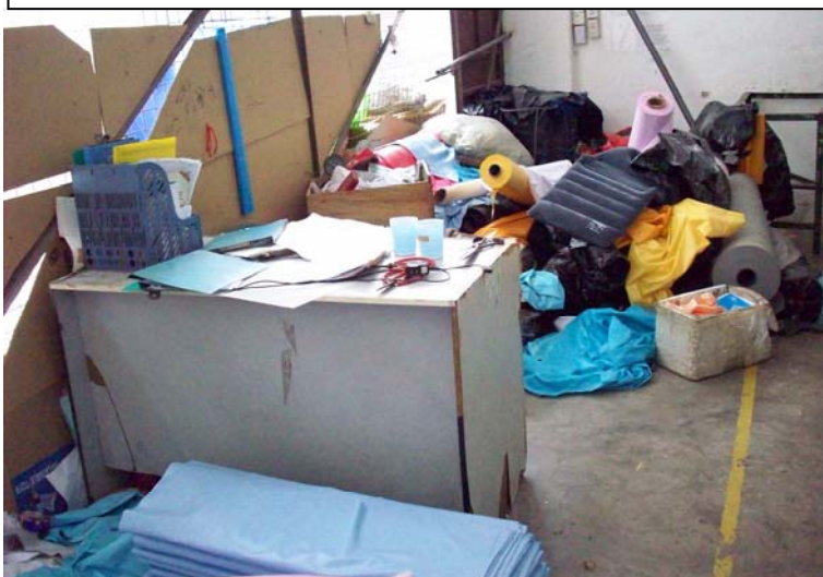
Image: Ordinary work environment of Duoyuan makes one wonder the quality and safety of production.

Duoyuan installed fire extinguishers in the dormitory hallways, the extinguishers are rusty and dusty, pointing to the absence of safety check-ups. In addition, many fire extinguishers lack pressure, thus incapable for its purpose. According to China's national regulatory laws, fire extinguishers need to be recharged if the pressure is below standard.