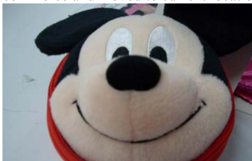
Image: Product provide by a Pearl Tower worker. Mickey Mouse is a trademark of Disney.

Pearl Tower Garments & Toys (Shenzhen) Co. LTD is invested by Bao Tai, a Hong Kong-based corporation. The factory mainly produces stuffed dolls, doll garments, stationeries, handbags, plastic toys and etc. Products are mainly exported to Europe, Japan, the U.S. and etc. The factory's original name was Shishen Toy Factory. On November 21 st 1992, the factory registered itself as Pearl Tower (Bao Tai) at the department of industry and commerce and moved to current location.