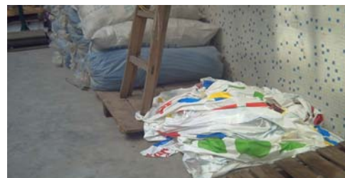
Image: Image of a pile of Twister, Hasbro's product being tossed aside in the factory.

Chemicals such as paint and diluents are used in the silk print department. However, Duoyuan does not provide any related chemical information nor does it distribute any safety equipment.