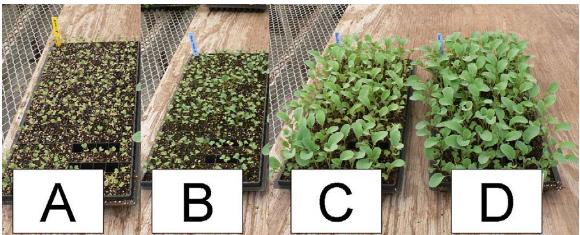
Figure 2. A. Cornell base mix, B. Cornell base mix + 7lb blood meal, C. Cornell base mix + 10% vermicompost, D. Cornell base mix + 10% vermicompost + blood meal. 19 DAP