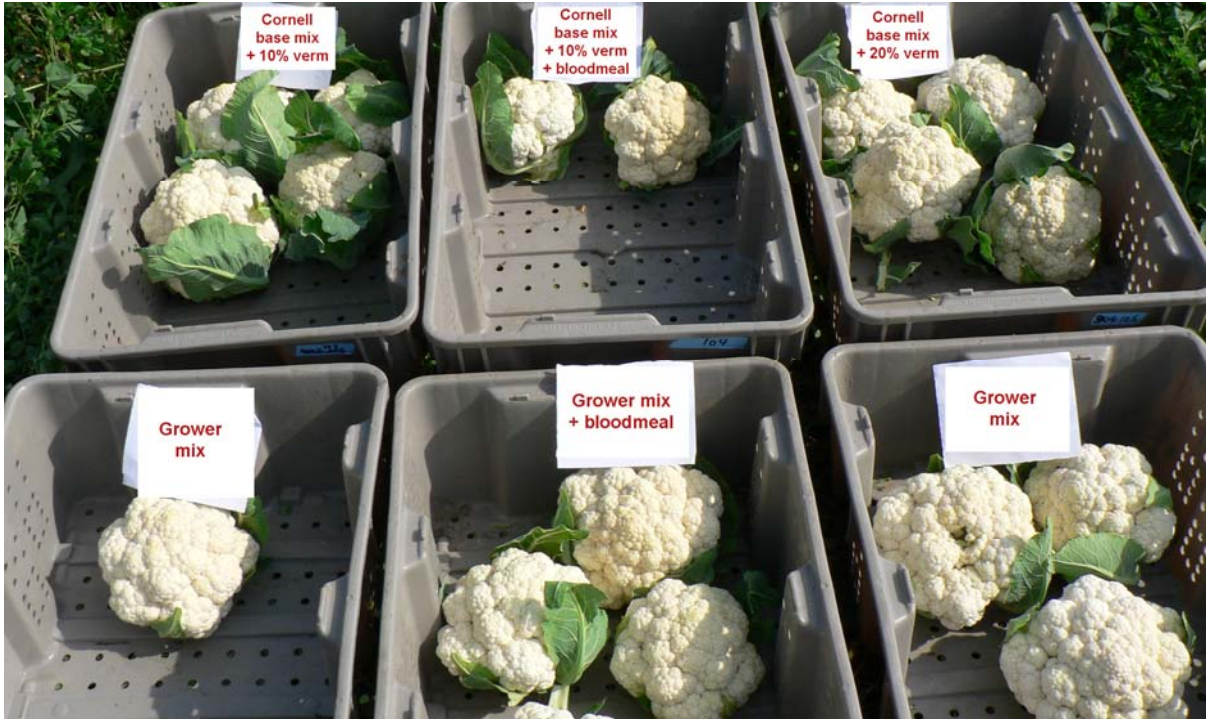
Figure 5. Cauliflower plants were transplanted on 7/9/08 and harvest on 9/25/08. Head labeled Grower mix on bottom left was produced from a transplant grown at 75° F day and 65° F night temperatures. Heads on the bottom right were produced from a transplant grown at 75° F day and 55° F night temperatures.