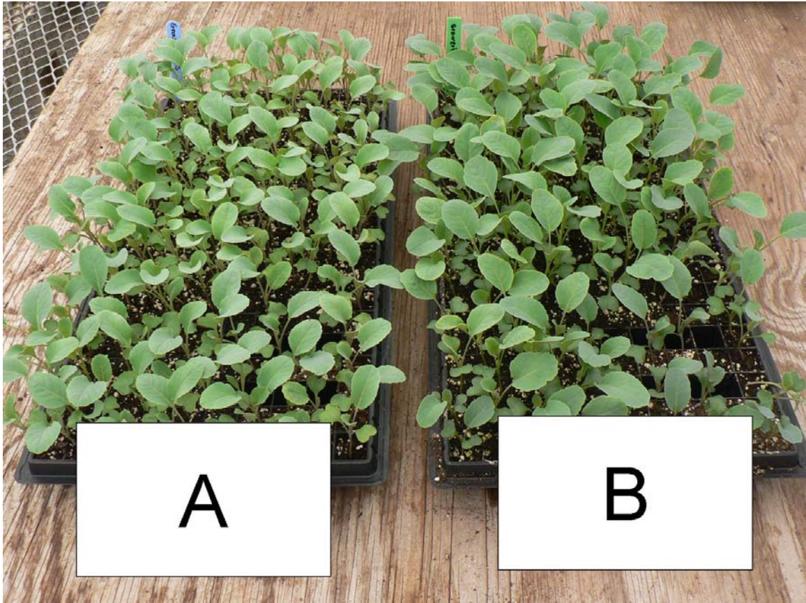
Figure 1. Blood meal enhances transplant growth when amended to grower's transplant mix. A. Grower's mix, B. Grower's mix + 7 lb. blood meal. 19 DAP