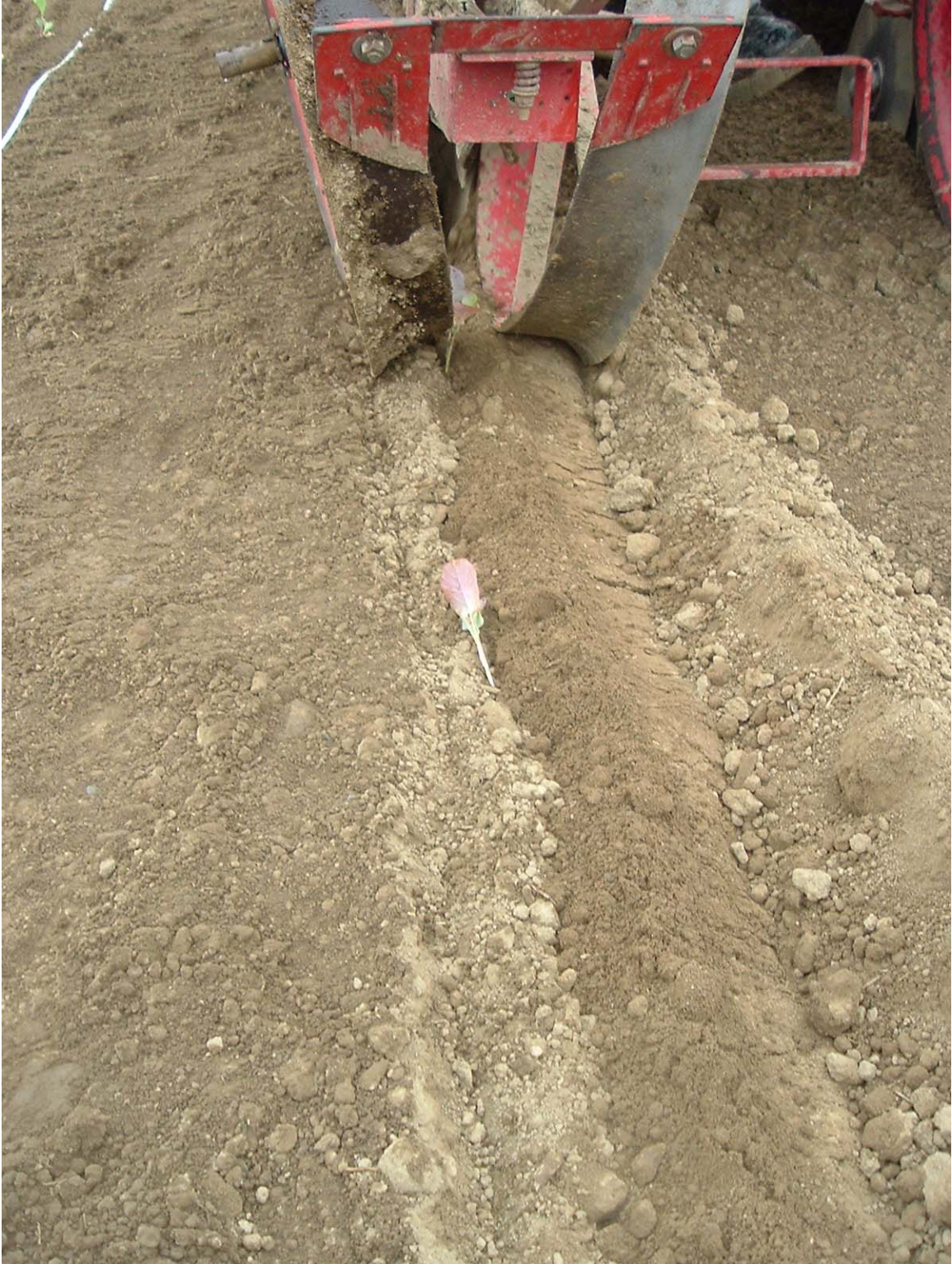
Figure 3. Six row transplanter and individual cauliflower transplant.