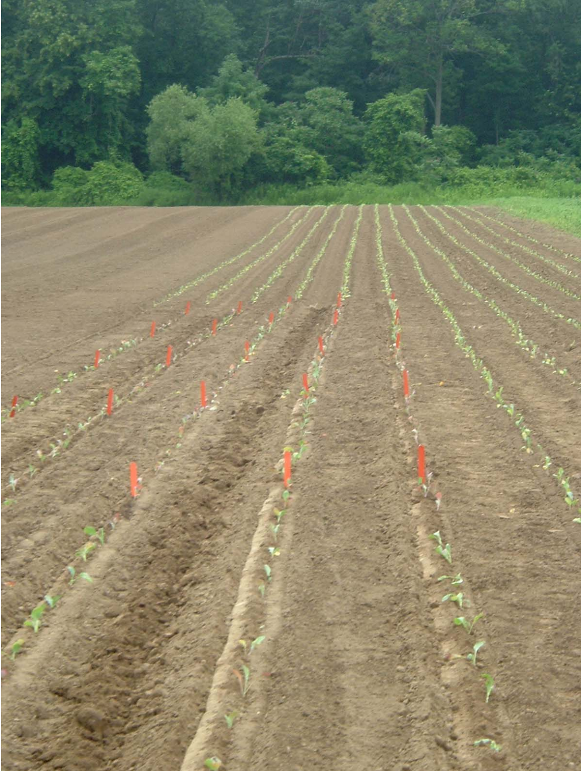
Figure 4. Experimental plots immediately after transplanting.