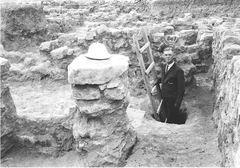
Fig. 1.2. William Frederic Badè, director of the Tell en-Naşbeh excavations, in a staged photograph exiting Cistern 369 during the 1935 season (Badè Museum photograph #1245. Courtesy of Badè Museum of Biblical Archaeology, Pacific School of Religion).

William Frederic Badè (Fig. 1.2), of what is now Pacific School of Religion, excavated the site in five lengthy seasons (1926, 1927, 1929, 1932, and 1935), eventually uncovering about two thirds of the site. A variety of preliminary reports were published during and after this period. Badè died in 1936, a year after the conclusion of the excavation. His death, the Great Depression, and the advent of World War II delayed the publication of the final report until 1947 (however, 12 years is less than the publication delays for many current excavations under far less difficult circumstances; for example, the third volume of Wright's excavations at Shechem appeared 29 years after the last excavation season). The two volume final report (McCown 1947; Wampler 1947) was brought to completion by Badè's seminary colleague, Chester C. McCown (Fig. 1.3), and his chief assistant during the last three years of the excavation, Joseph C. Wampler (Fig. 1.4). McCown dealt largely with the site's archi-