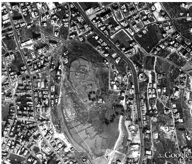
Fig. 1.6. Satellite image of immediate environs of Tell en Naşbeh (kidney shape feature near center of image). The road on the right connects Jerusalem with the Nablus/Shechem region to the north. Note the encroachment of modern buildings in the vicinity of the site. The buildings to the west (left) and north (top) of the site are built over two of the settlement's ancient cemeteries.

Badè had hoped to undertake a study of the fingerprints found on the site's ceramics. With today's scanning and computing technologies such a study, including other sites in Israel, might yield interesting results. Source analysis of various ceramics from Tell en-Naşbeh has already been undertaken by various scholars, but, as suggested above, more could be done (Mommsen, Perlman, and Yellin 1984; Zorn, Yellin, and Hayes 1994; Gunneweg et al. 1994). For example, the wedge- and circle-decorated pottery, found so abundantly at Tell en-Naşbeh and other sites in Israel, has also been found in Jordan and northern Arabia (Zorn 2001). From where does this pottery originate and what would such a study reveal about international connections in the later Babylonian-Persian