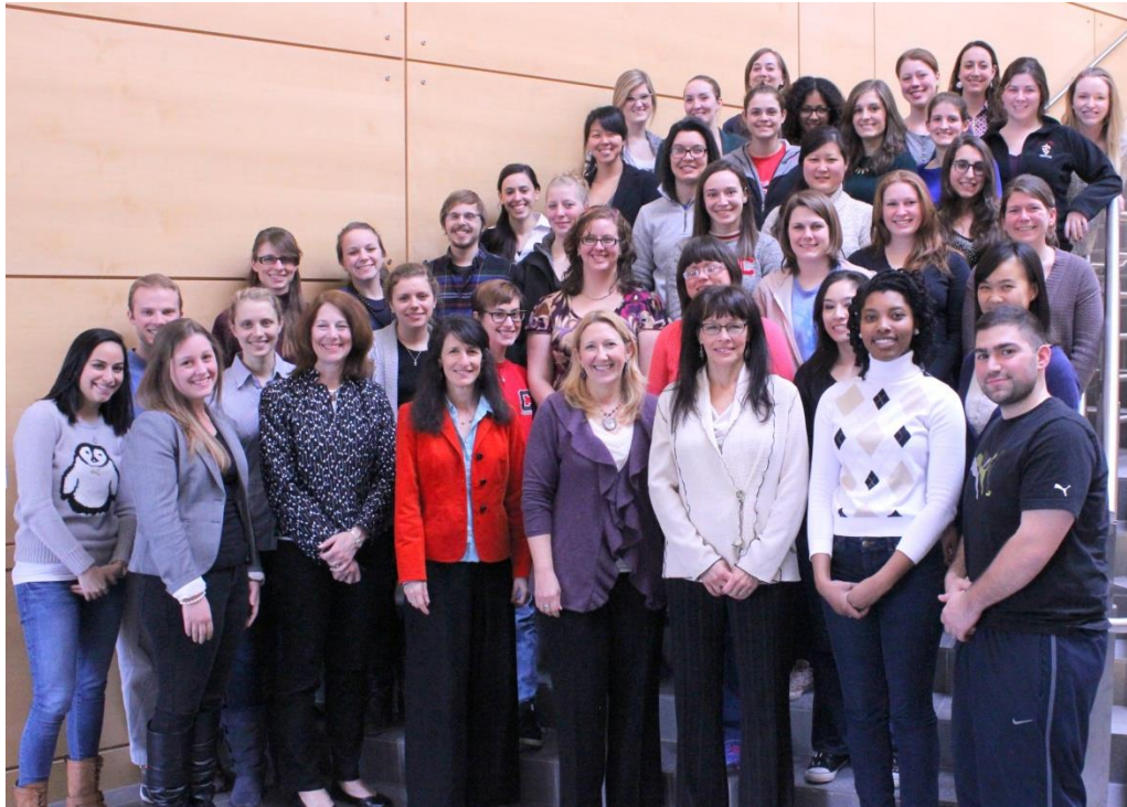
Attendees and instructors at the first student course on Women's Leadership in Veterinary Medicine Cornell University, March 1, 2014