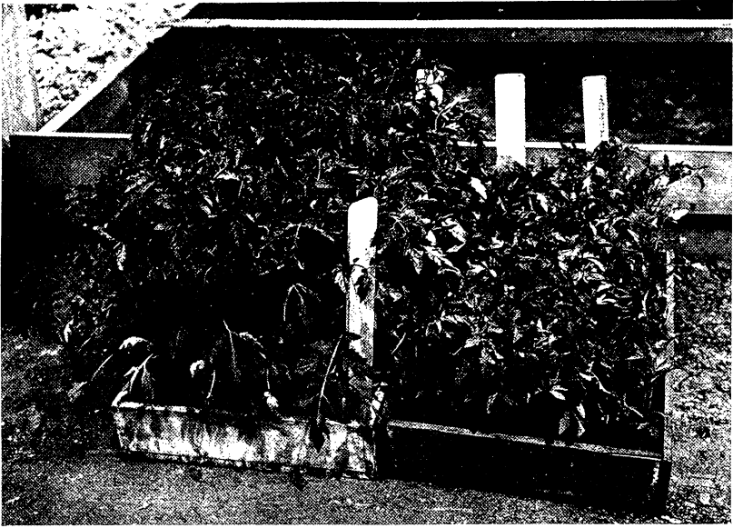
FIG. 2.—ELECTRICALLY PASTEURIZED SOIL PRODUCES VIGOROUS PLANTS.

Tomato plants of equal age ready to be transplanted into the field. Those in pasteurized soil (A) are taller, greener, and more vigorous than those in unpasteurized soil (B). Plants in the unpasteurized soil are yellowed and bronzed, are small and scrawny, and have roots that are browned and more or less decayed. These plants will start off in the field more slowly than those in the pasteurized soil.