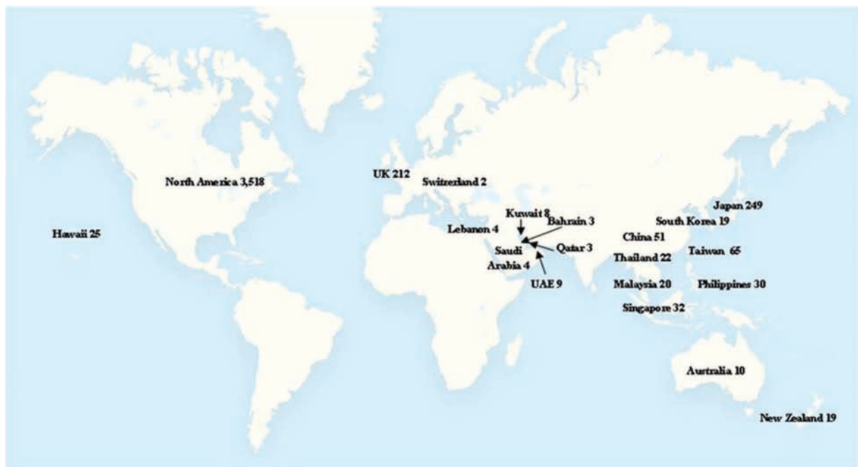
Exhibit 2: Starbucks Locations and Number of Stores (as of May 2001)