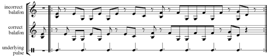
Figure 3: “Soli” pattern two

“Soli” is confusing not just for the 12/8 meter but because the second pattern is a “layered melody.” It can also be rendered in 4/4 time, but it is half-syncopated to the downbeat of the four-count in pattern one. Inexperienced people with Manding music are not accustomed to hearing cyclical syncopated melodies in this fashion. I showed a musically notated description of “soli” pattern one and pattern two to a learned jazz musician friend of mine. He did not see anything so unusual on the paper notation. Then I showed him a video of Famoro and me playing the two patterns at once and he was duly impressed. He could not believe that Famoro maintained the syncopated melody easily and could even improvise on it without any signs of effort. Putting these two patterns together occupies much of the problem for the inexperienced student, as exemplified in the following sections.