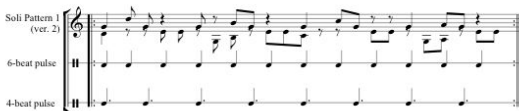
Figure 2: “Soli” pattern one version two

When I learned to divide pattern one of “Soli” into four beats per measure, it was an instant click, like someone flipped a switch. It was not my conscious effort that ultimately allowed me to switch from my focus on the six-count to a focus on the four-count. Intellectually, I needed to know that an alternative possibility was there, and to know generally where it stood or I would have remained complacent in my own way of hearing the rhythm. Bacar indicated that the consistent pulse of the G was my cue. It was ultimately my responsibility to feel it there. It was not a matter of getting used to the fancy “drum fill-like” pattern as I had thought. When it happened, it was an effortless feeling in the body, and there was no mental struggle. I clicked into another groove. Sheer intellect could not break through this cultural barrier. I tend to want to reason myself into hearing and playing the music with a Manding feel, but the West African jali teachers, like Famoro and Bacar, teach us to feel it through the body, through feeling, and through an easy, relaxed concentration. It was in the midst of not thinking about it that it became apparent. Now I feel this pattern in four beats per