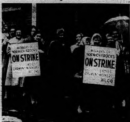
Sparking a drive against non-union holdouts in Meriden, Conn., the workers of Norwich Frocks have been picketing since March 15 while waiting action on a petition for an NLRB election.