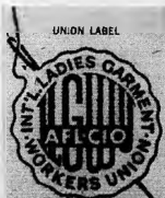
Symbol of decency, fair labor standards and the American way of life

The bitter garment strikes of the early 1900's made labor history. Out of those struggles came a living wage, the right to work in dignity and safety, and — in 1923 — the first