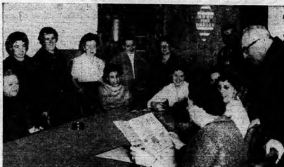
Before the actual drills were undertaken in the shops fire wardens met at union headquarters to scan educational matter, hear history of safety programs in garment industry, learn plans for inspections, drills.