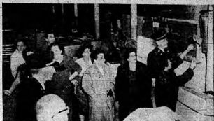
Fireman points out the wrong place for fire extinguisher and the wrong way to hang it. Extinguishers should be located within easy reach in any emergency.

Meanwhile, in Fall River, Mass., a typical ILGWU program was launched last month. Working with the local fire department authorities, garment workers in several centers in the district are starting similar safety drives.