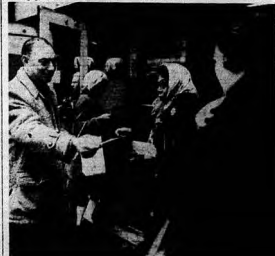
"Look for the union label" is the advice given to shoppers in New York City's Herald Square by members of the Dress Joint Council in the first of a series of weekly distributions of ILGWU latest fashion information. Shoppers will use shoppers to this garment produced by non-union manufacturers.