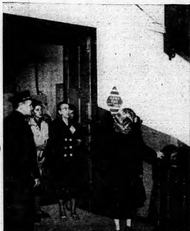
Fireman supervising drill demonstrates advantage of holding back evacuees from lower floor long enough to let upper floors march down stairs.