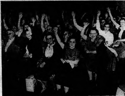
Minneapolis strikers vote unanimously to ratify new pact won following a three-week walkout which brought gains to 600 workers in Minneapolis, and Glencoe, Minn., and St. Croix Falls, Wis.

Six hundred staunch union members, who walked the picket line for three weeks, have walked it all the way to victory in Minneapolis. Employers agreed to all union demands and the settlement was ratified unanimously on March 16.