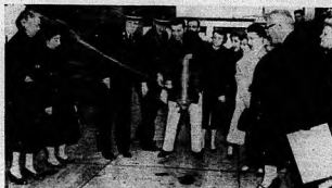
Fall River is one center where wardens learn use of extinguisher. Here, fireman demonstrates the accuracy with which inverted fire extinguishers can be aimed.