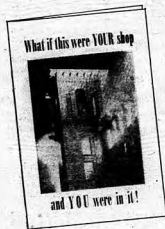
This cover of a special leaflet features picture of Fall River fire.