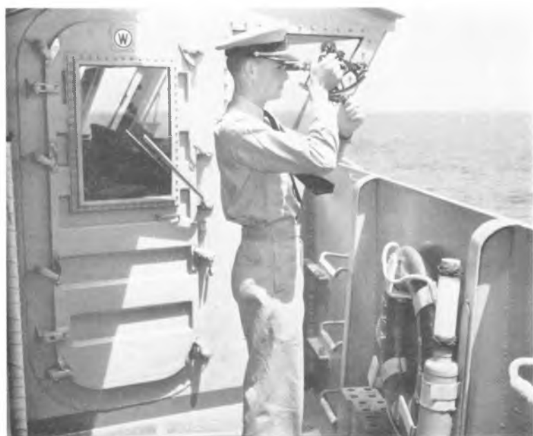
Summer cruise. Midshipman shooting the sun.