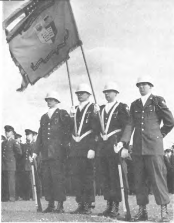
Army cadet color guard prepares to pass in review.