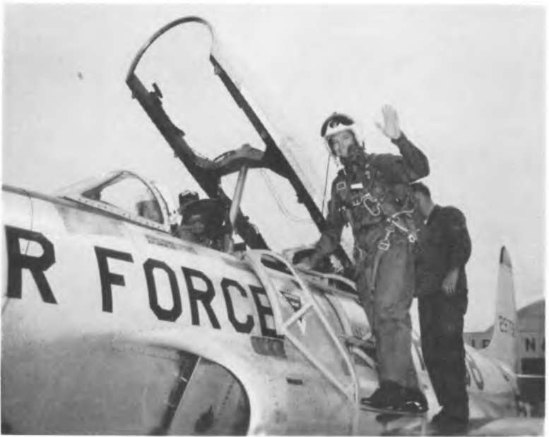
Advance cadet begins jet orientation during summer training.