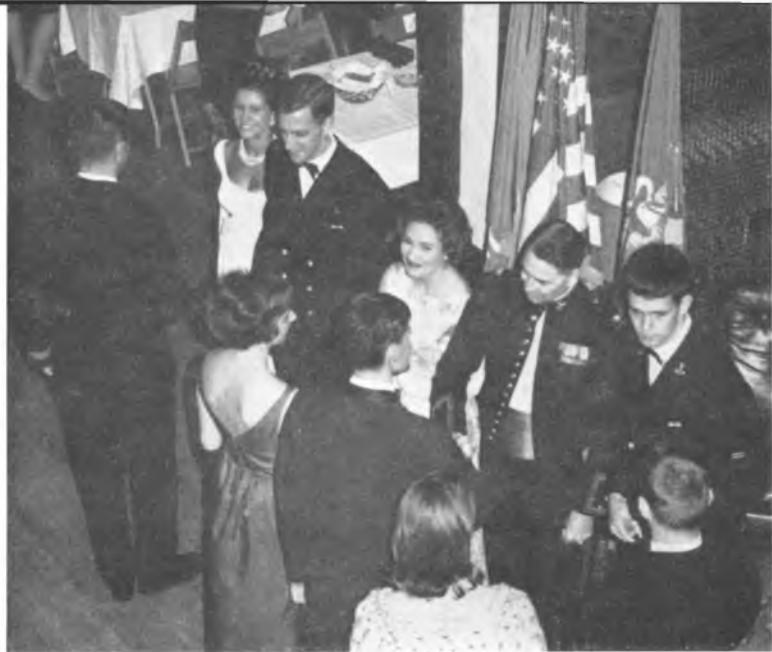
Receiving line at the Navy Ball.