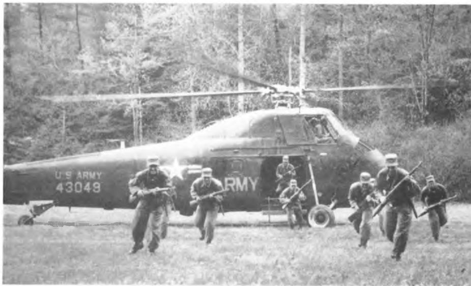
In summer camp Army ROTC cadets participate in demonstrations that utilize the newest Army equipment.