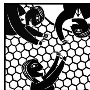
Table 1: Communities of Practice—What are They?