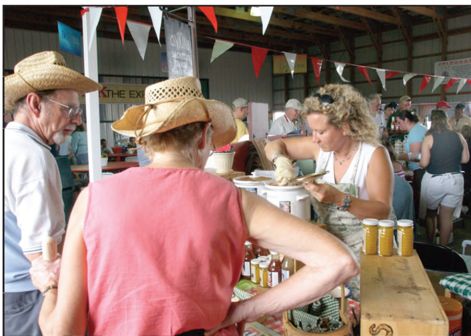
Food products developed with Cornell expertise were available at Empire Farm Days 2007 and will be again at this year's edition.