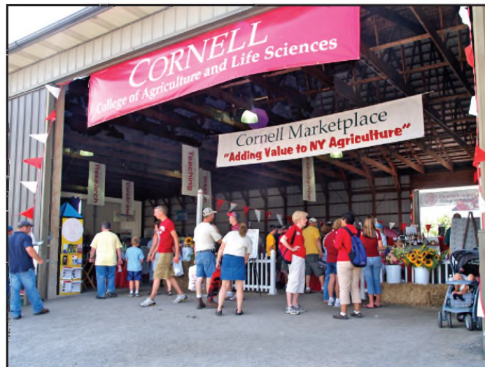
The CALS building at Empire Farm Days 2007 drew big crowds.