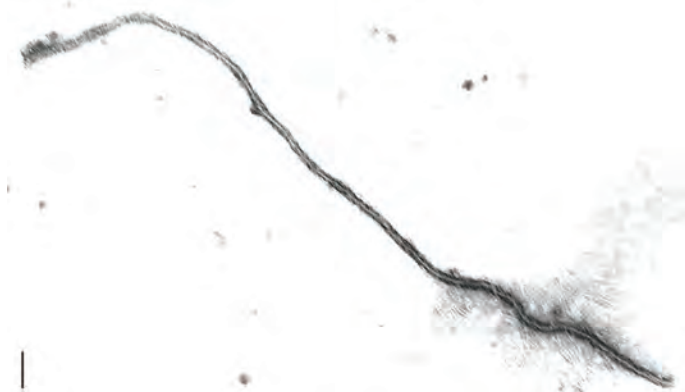
Figure 2. Electron micrograph of a GLRaV particle isolated from a leafroll-diseased vine. Note scale bar for particle size (1 nanometer - nm - equals 1/1,000,000 millimeter).

Among the five viruses associated with leafroll disease, GLRaV-1, GLRaV-2, and GLRaV-3 usually prevail in leafroll-affected grapevines. Additionally, GLRaV-2 also incites severe graft-incompatibility syndrome and a decline of scions grafted on certain rootstocks, including Kober 5BB, 3309C, 5C, 1103P, Harmony and Freedom.