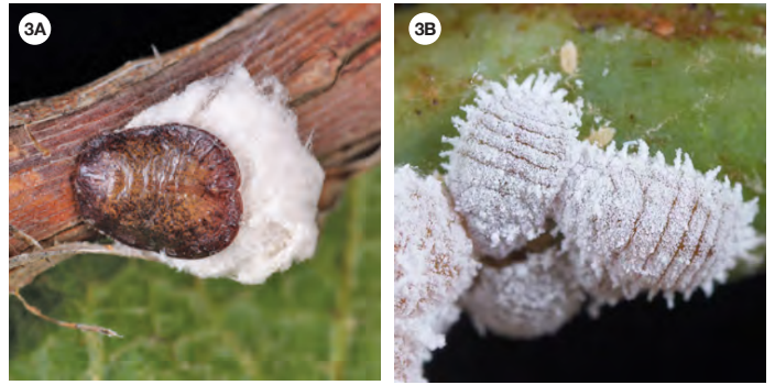
Figure 3. (A) A soft scale female with white egg sac collected in a vineyard near Seneca Lake, and (B) Mealybugs, potential vector of GLRaVs.

The most efficient means of spreading leafroll-associated viruses is through vegetative propagation and grafting. GLRaVs can be moved across long distances in planting and propagation materials. In addition, insect vectors in two homopteran insect families (mealybugs, Pseudococcidae , and soft scales, Coccidae ) can also transmit GLRaV-1, GLRaV-3, and GLRaV-4. Mealybugs and soft scales feed on a wide range of host plants and can be serious pests of woody plants, including Vitis . Most species overwinter as eggs and young instar nymphs beneath the bark of the trunk. Only a few species can overwinter underground on the roots. Females are wingless but can exhibit limited mobility, while adult males, which lack mouthparts, and hence, cannot feed and transmit the viruses, are winged. Because of their small size, crawlers and adults can be readily wind-blown.