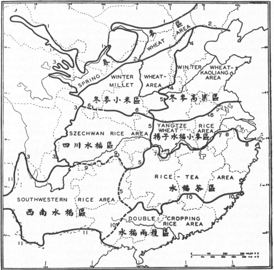
Figure 1. Agricultural areas of China. The land utilization research provided the basic information for dividing China into 2 major agricultural regions and 8 subregions called "areas". Each area's name indicates the dominant crop or crops produced in it.

production rather than money value in comparing efficiency by size of farms. Quantities were ascertained in terms of the main food grain crops of a locality, such as wheat, rice, or millet. Other crops were converted to grain-equivalent in terms of the exchange value of the other crops or the equivalent food value. For instance, the production of grain-equivalent per man-equivalent per year in kilograms by size of farm groups from the smallest to largest farm group was as follows: 833, 1174, 1456, 1689, and 2073 kilograms; or an average of 1393 kilograms per farm. On a per capita basis of all household members by size of farm groups, the