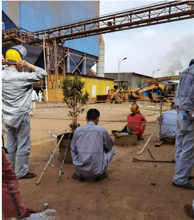
Chinese workers forced to guard their factory with issued steel pipes as weapons to attack Indonesian demonstrators

demonstrators who tried to breach the factory. As a result, more than a dozen Chinese workers were injured in the conflict.