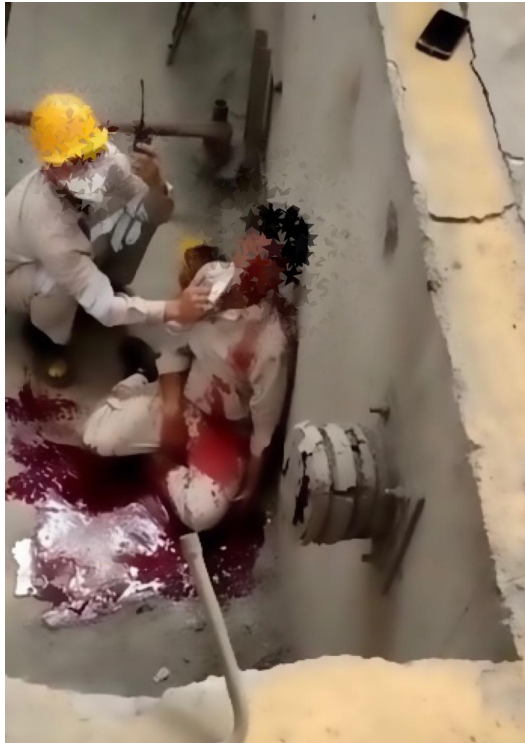
A worker died at work after being pinned between a ladle truck and a wall