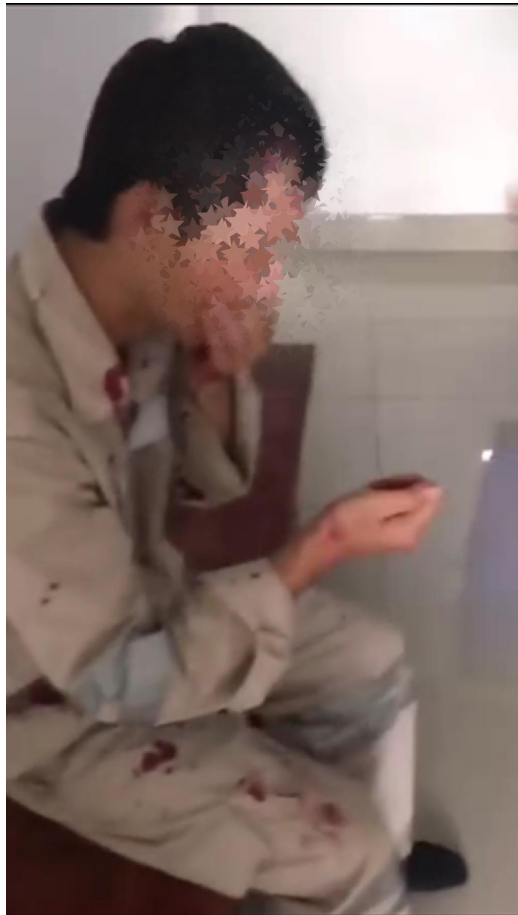
A worker beaten in workplace