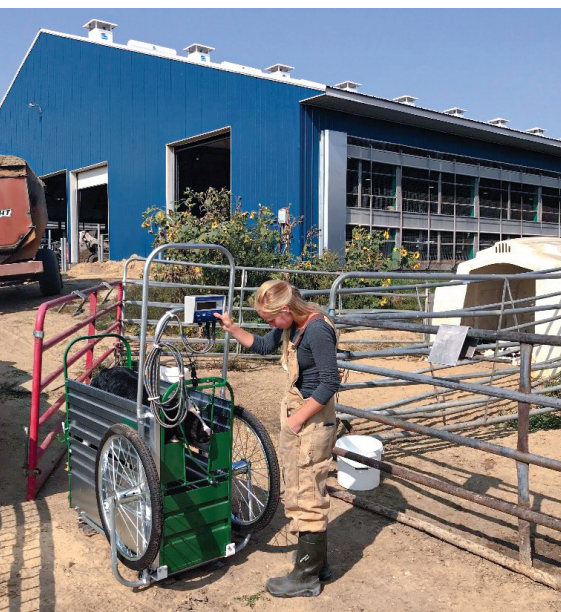
CCE NCRAT dairy specialist Casey Havekes weighs a calf on a northern NY dairy.