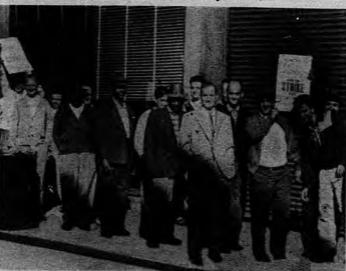
Workers at Nesser Alloy plant in Newark, N. J., members of New York Plastic Molders and Novelty Local 132, picketed 24 hours a day for more than a week. Result: One more unionized plant, 24-cent-an-hour package of gains under new ILGWU contract.