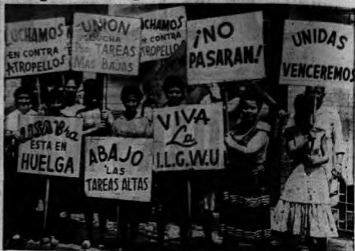
Workers at Lisa Lingerie Co., recently established garment shop in Puerto Rico, learned quickly that union contract is only protection against tricky employer. On first day of strike, two ILGWU organizers were illegally arrested, one of them beaten at station by local police.

officer between the New York Dress Joint Board and the workers in the nearby out-of-town dress shops covered by the dress contracts negotiated in New York.