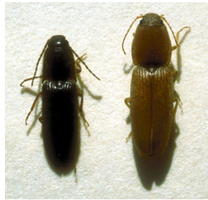
Conoderus species; larva (wireworm) on left; Adult form (click beetles) on right