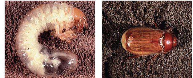
Scarab beetles; larva (white grub) on left, adult (European chafer) on right.

White grubs are the larval forms of several scarab beetles: Japanese beetles, May or June beetles, or European chafers. White grubs are thick, white, soft-bodied larvae about ¼ inch-1 inch long that curl into a C-shape when disturbed. They feed on corn roots and are normally a problem in first year corn after sod. Symptoms are hollowed-out seed, gaps in corn rows at time of emergence, and wilted or stunted seedlings.