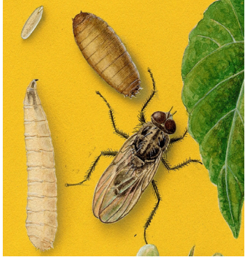
Life stages of the seedcorn maggot, Delia platura , showing the egg, larva, pupa, and adult fly. Illustration by Art Cushman, USDA

Seed corn maggot adults resemble the common housefly. Females lay eggs in moist soil cracks, high organic matter, decomposing plant material, and germinating seeds. Maggots are pale yellowish-white, tapered, legless, appear to be headless, and reach a length of about ¼ inch. They burrow into germinating seeds to feed. Seed may not germinate; seedlings are weak and often die. You may see small shot hole injury on cotyledons and first true leaves. Damage is more severe in cool, wet spring weather that delays seedling emergence. Maggots attack corn, soybeans, dry beans, and other large seeded crops.