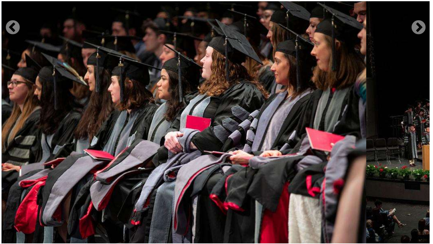
The Cornell veterinary class of 2019 at their hooding ceremony. The 2019 veterina of Veterinary Medicine.