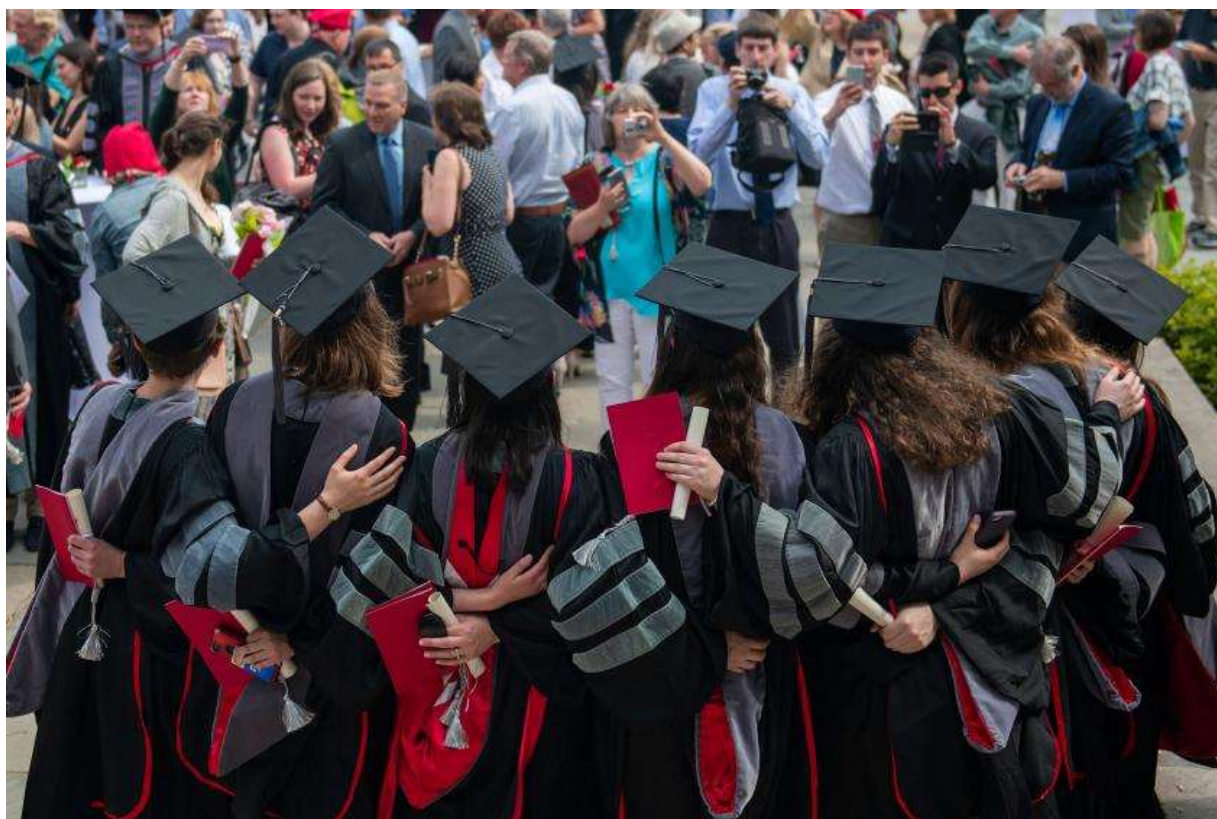
Members of the Class of 2019 pose together after their hooding ceremony at Bailey Hall.

After countless hours of lectures, late nights studying and immersive learning on the farm or in the clinic, the Cornell veterinary class of 2019 was recognized through the college's hooding ceremony on Saturday, May 25 at Bailey Hall.