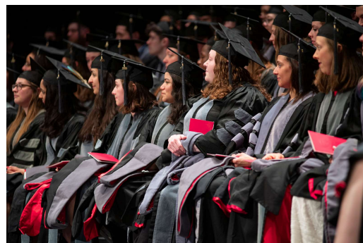
Graduates from the Class of 2019 listen to speakers during their hooding ceremony.