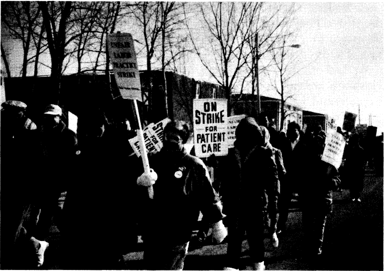
Bi-weekly solidarity marches were held around the hospital and through the community by the SJNA/INA and their supporters.

Making amends with the labor leadership was a top priority, although we never lost the support of rank and file members throughout the strike. The Community Outreach committee channeled union support into fundraising, political action, and mobilizing their individual locals into boycotting the hospital. We also organized bi-weekly candle light marches and solidarity parades around the hospital which drew 200-500 nurses and supporters each time. Unions that actively supported the strike included the Operating Engineers, Machinists, SEIU, AFSCME, Police, Firefighters,