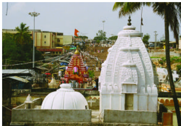
Above: A view of the temple complex at Saundatti.