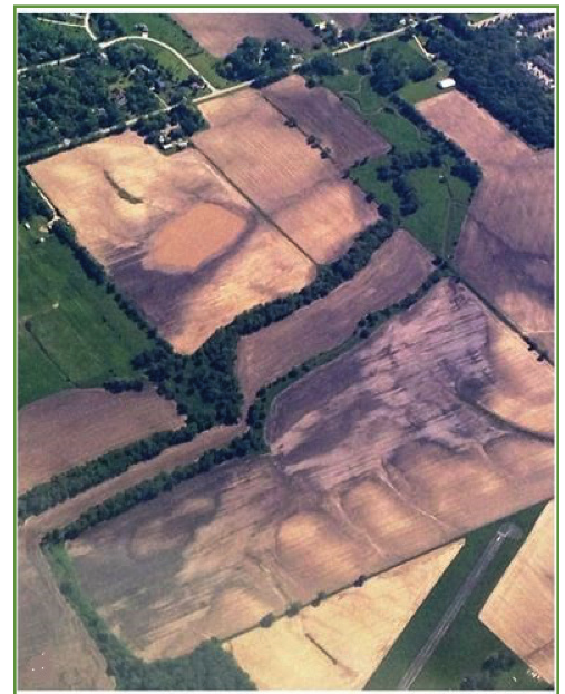
Figure 2. Weather and soil health properties interact to influence soil N dynamics. Such field-scale differences influence physical and biological factors that drive N mineralization and losses as shown in the aerial view of Ken Humpal’s farm.

What is on Shannon Gomes’ mind for the future? He is strongly interested in soil health testing and helping his clients improve their soil management. Soil health and nitrogen management are closely connected (Figure 2), and Gomes is looking at cover crop and tillage system impacts on soil health and nitrogen dynamics. This way, his farmers can reap the benefits from improved soil health through increased yields and higher N availability, as estimated by Adapt-N.