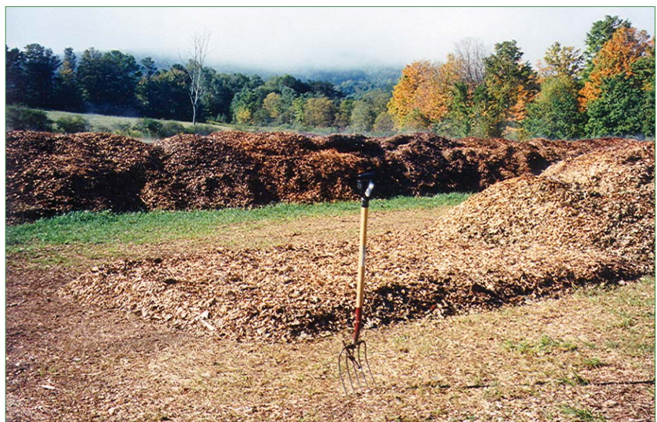
Prepared 24” wood chip compost bed.

When using or spreading the composted material, the bones can be removed and put in a hedgerow or forested land. Because they contain phosphorus and calcium, rodents will eat them; the smaller bones can be incorporated or land spread and will disappear quickly.