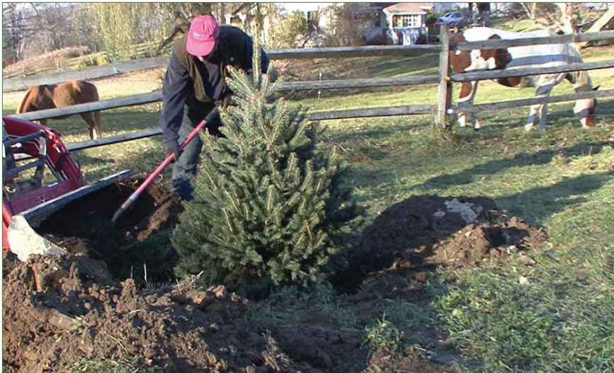
Planting a tree with compost in memory of the horse.