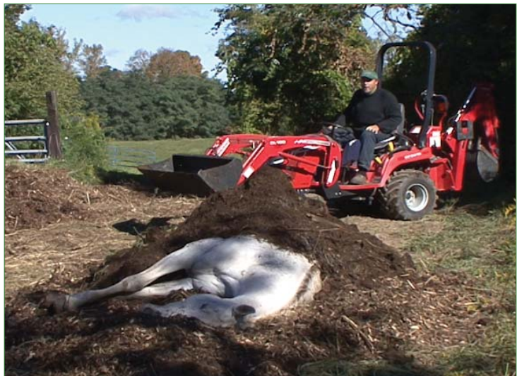
Horse being covered in woodchips.

If your horse has been euthanized with a drug such as sodium pentobarbital, care should be taken to dispose of the remains as quickly as possible. They will contain potentially harmful residues. Wildlife and domestic animals may be attracted by the carcass and become intoxicated or die if allowed to feed on it. Properly built compost piles will deter pets and wildlife from feeding on carcasses. Sodium pentobarbital has been shown to degrade during the composting process so that by the time composting is finished (within six months) very low levels of the drug remain.