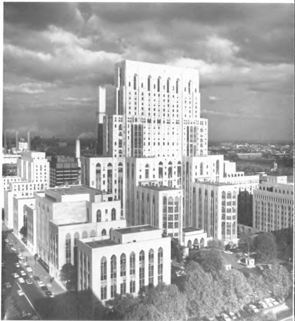
The New York Hospital-Cornell Medical Center, located at 68th Street and the East River, covers three city blocks—68th to 71st Streets—and includes The New York Hospital, the Cornell University Medical College and the Cornell University-New York Hospital School of Nursing.