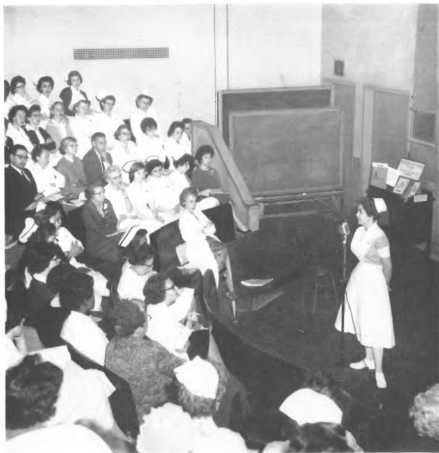
Students present patients to faculty, staff, and fellow student nurses at Nursing Rounds, a unique opportunity in nursing leadership.