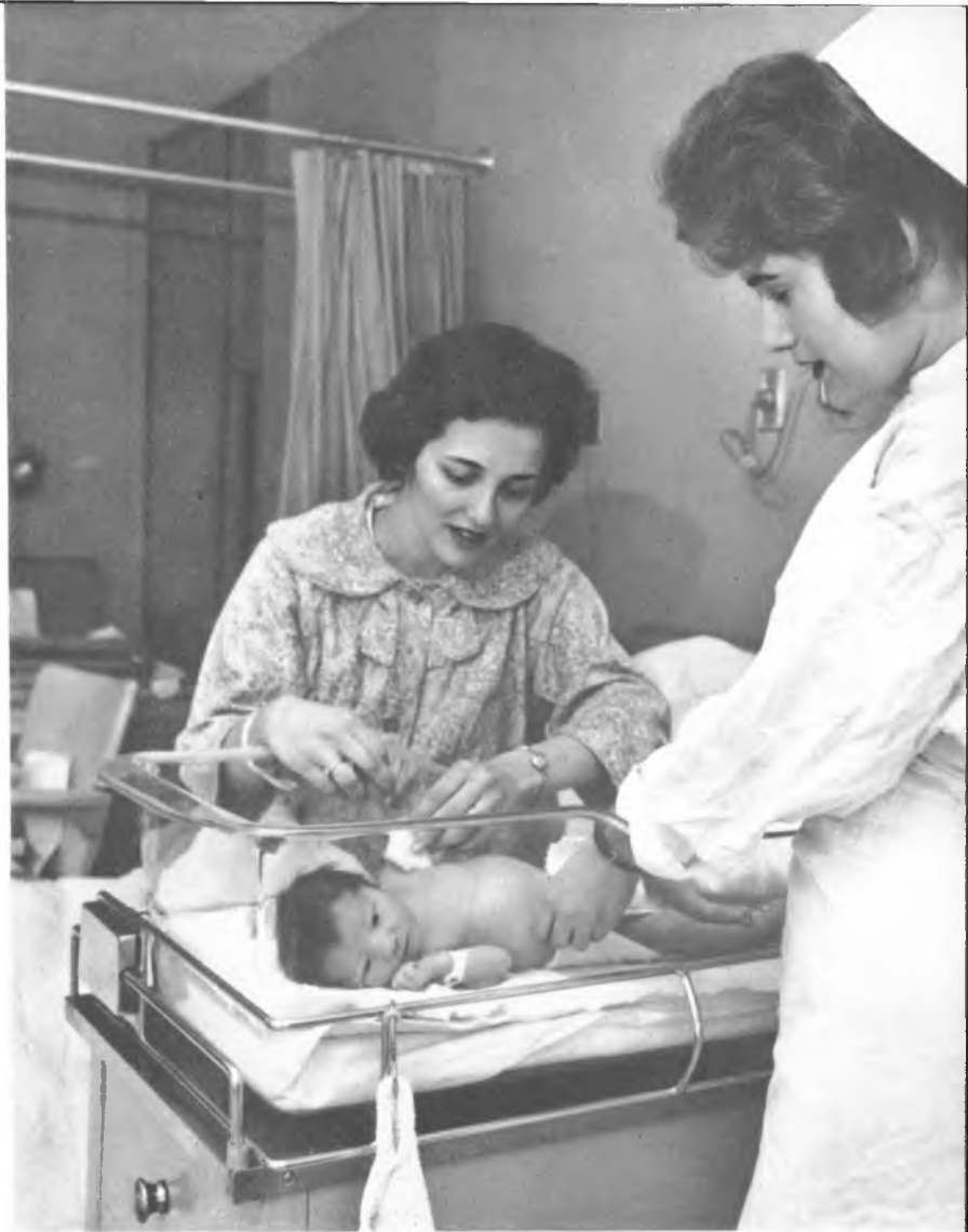
An important part of nursing practice is teaching patients principles of home care.