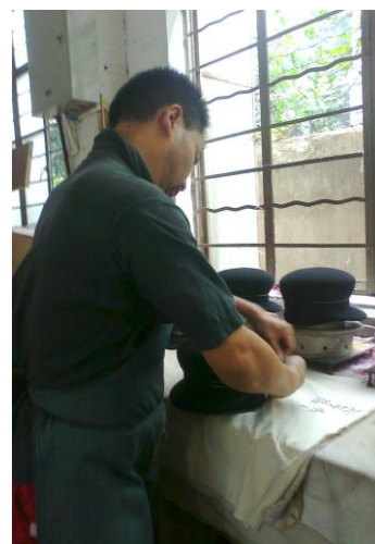
A worker is making hats