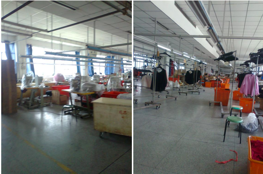
The workshop is rather clean and spacious, but the clothes are a bit unorganized.

Investigation Date: July and August 2011