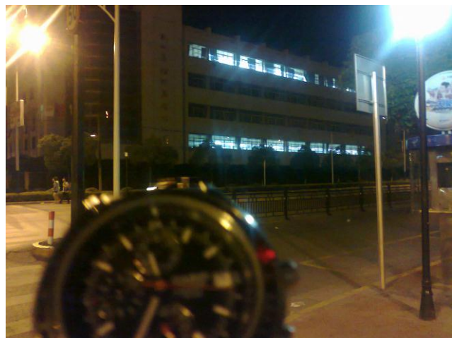
At 11:30pm, the factory floor is still lit up with workers working overtime.