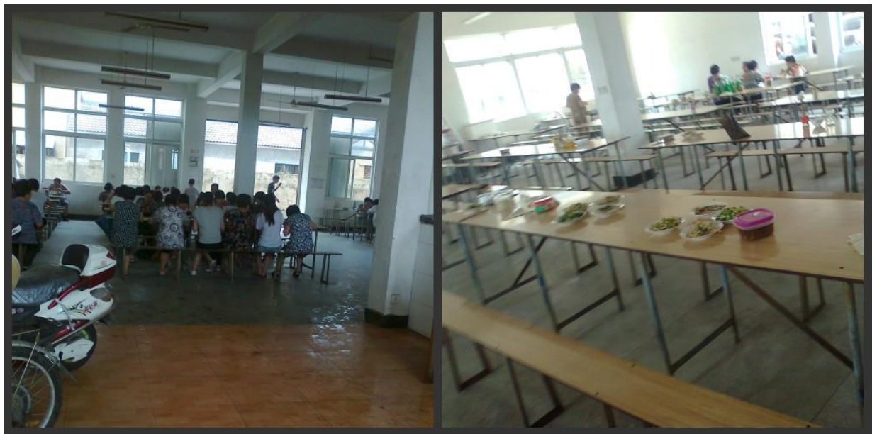
Workers are dining at the cafeteria

Notification from Cixi Government: the base salary is 1,160RMB and the minimum hourly wage is 9.5RMB.