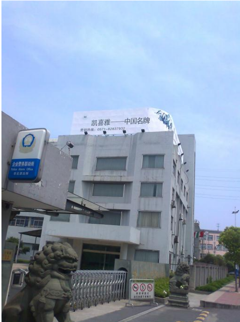
Zhejiang Cathaya Clothing Pty Ltd environment