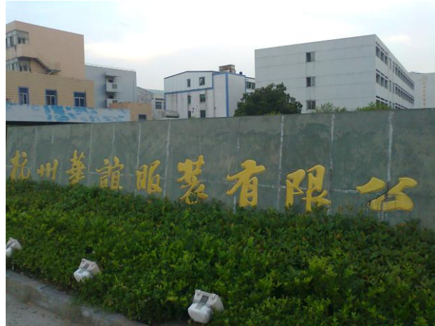
The factory sign of Sino-Italy Apparel Co., Ltd