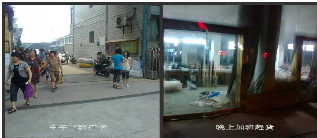
(Left) Workers get off from work/ (Right) Workers work overtime at night