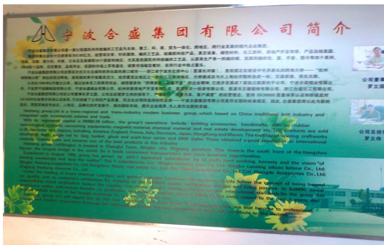
Introduction of Ningbo Hesheng