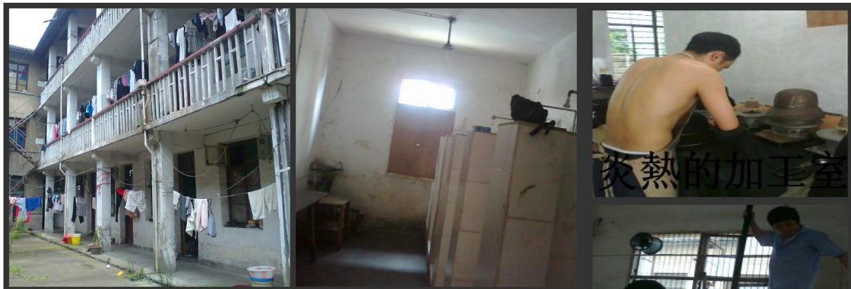
Top: (Left) Dormitory/ (Right) Bathroom