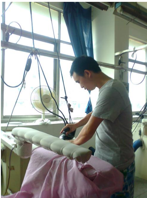
A worker is pressing clothes.