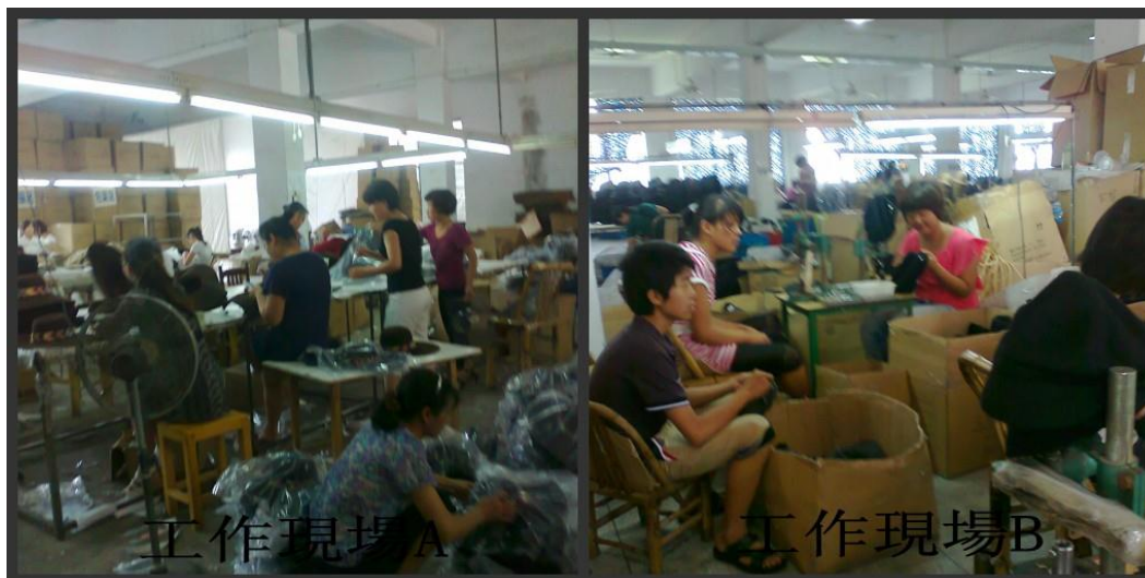
Working environment of the factory