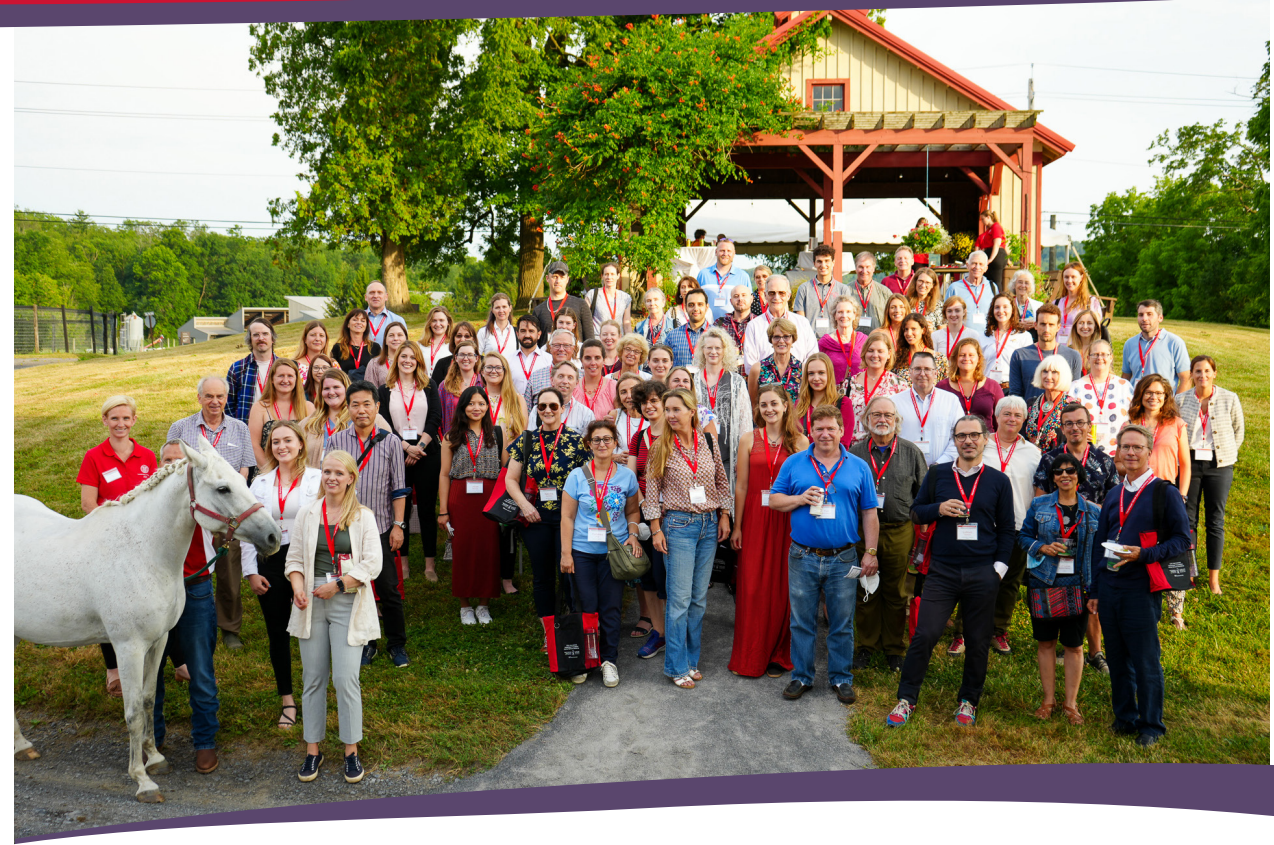
Twilight was the star attraction at the International Havemeyer Foundation Horse Genome Workshop that Cornell hosted in July of this year.