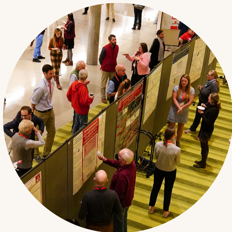
Poster presentations at the annual Zweig event.