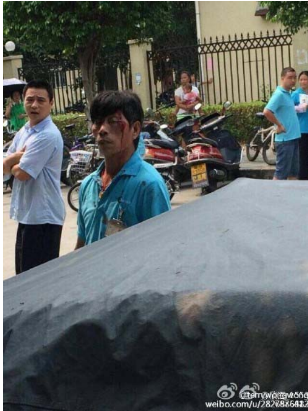
A worker bleeding. (social media)