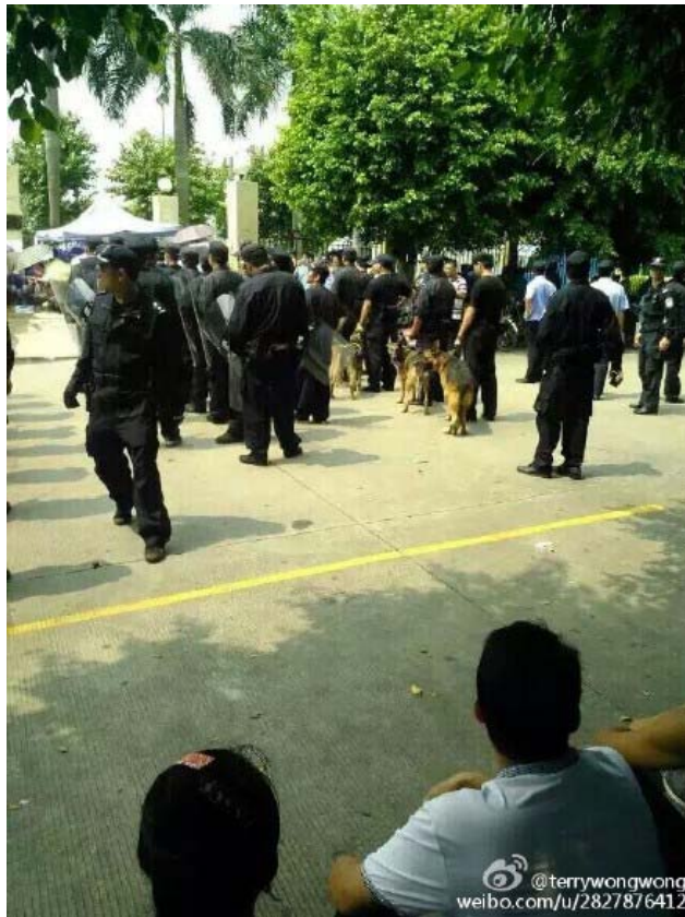
Riot police and K-9 units surrounding Ever Force workers.