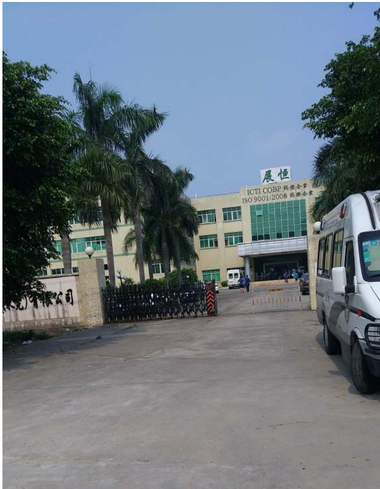
Ever Force factory. (CLW)