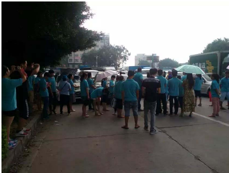
Workers blocking the road.