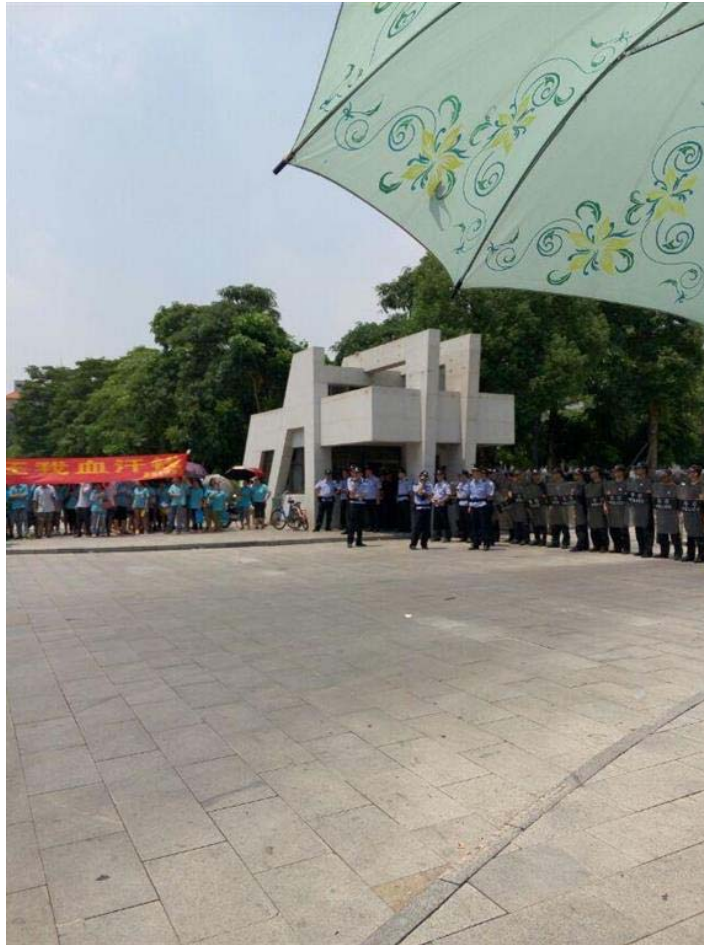
Heavy police presence as Ever Force workers protest.

Workers protested again on August 6. Authorities this time called on a large number of riot police to put down the demonstration, arresting about 20 workers in the process. As of the evening of August 6 (Beijing time), these workers remain in police custody. Workers said that the Shipai township government has told workers that the release of these 20 people is contingent on workers accepting a final offer of 90 percent of unpaid wages. Some workers have already accepted the offer.