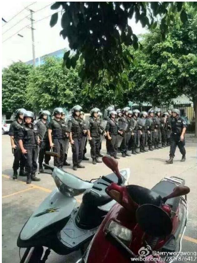
Riot police.