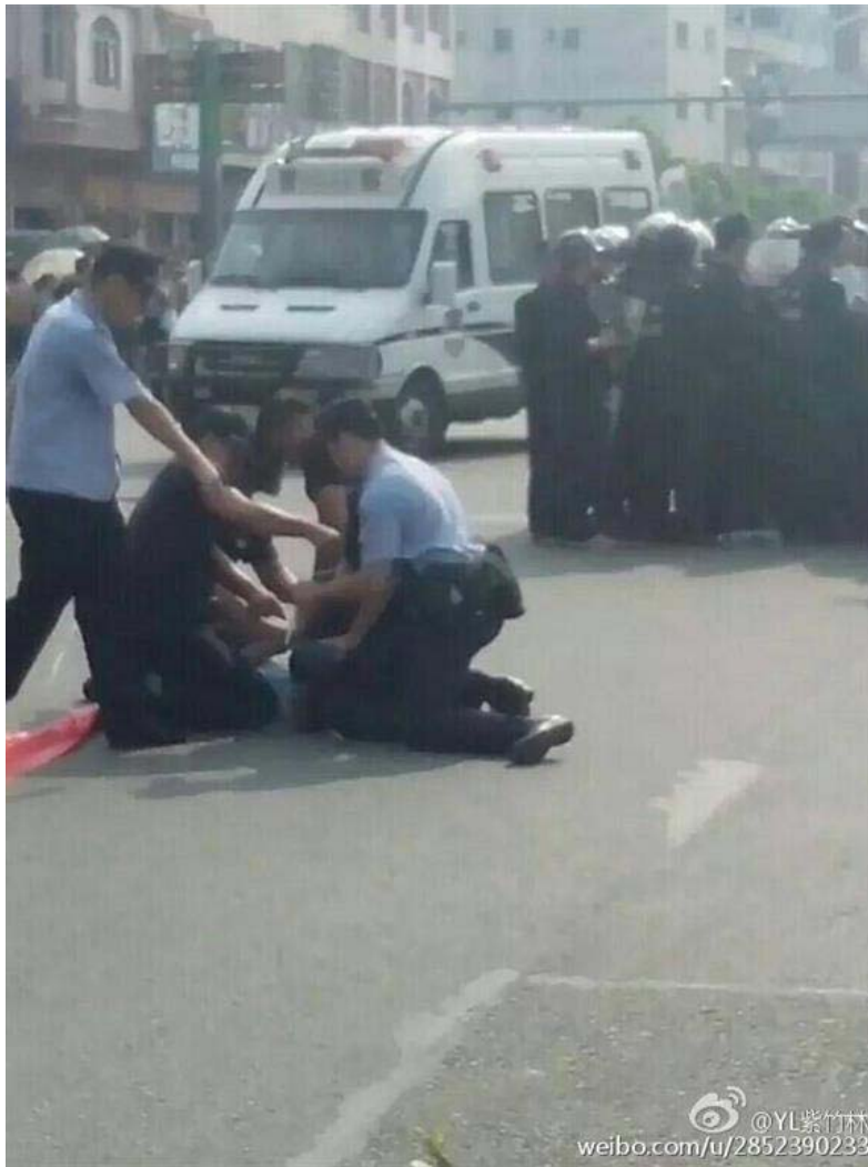
Police holding down a protester. (social media)