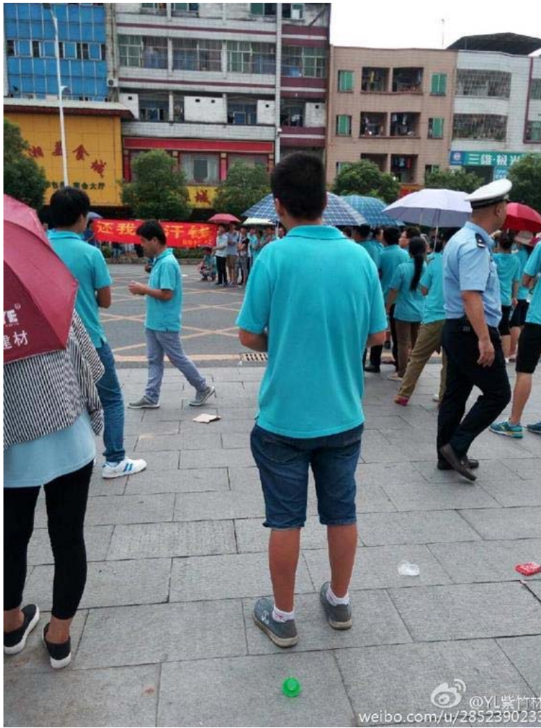
Ever Force workers protesting. (social media)