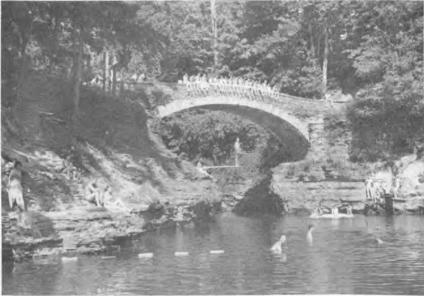
Beebe Lake is a favorite place for swimming and sunbathing.

have appeared on the rolls of the Hotel School and have won recognition for themselves later in the field are too numerous to list here. They include such institutions as Dartmouth, Harvard, Yale, University of Pennsylvania, Virginia, Michigan State, Tulane, and California.