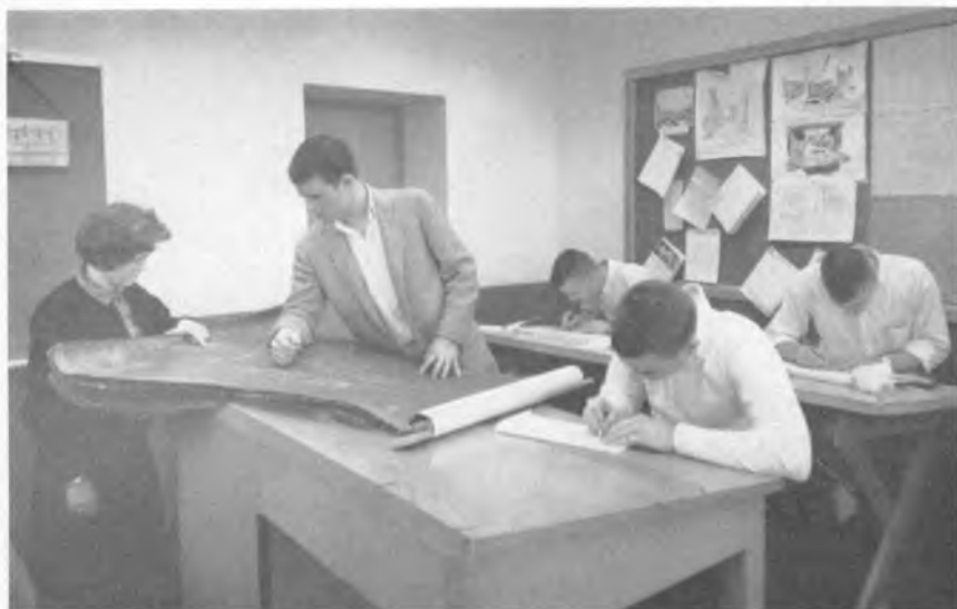
Engineering management requires a thorough knowledge of graphic communication. Students in hotel administration gain this understanding not only by working with actual building blueprints but also by learning many of the techniques of technical drafting and presentation.

HOTEL STRUCTURES AND MAINTENANCE ( Hotel Engineering 266 ). Credit three hours.