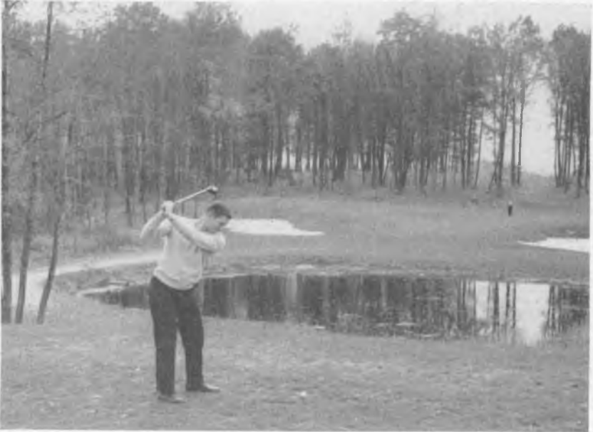
Hazards of the 6th hole on the 18-hole golf course.

Hotel students participate in the intercollegiate matches of the Ivy League in all major and minor sports. Equally attractive to most students is Cornell's outstanding intramural athletic program. The School of Hotel Administration fields teams in all major sports.