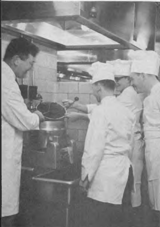
Commander Bond instructs students in his quantity food production course in the use of a high-speed, low-water, all-electric trunion kettle for the batch cooking of spinach and other vegetables in order to preserve the nutrients.