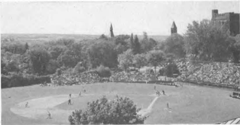
Hoy Field on the Cornell campus has been the scene of many an intercollegiate baseball game.

Hotel students field a number of teams for intercollegiate competition on the campus, and most of them as individuals appear at one time or another on interfraternity or interdormitory teams.