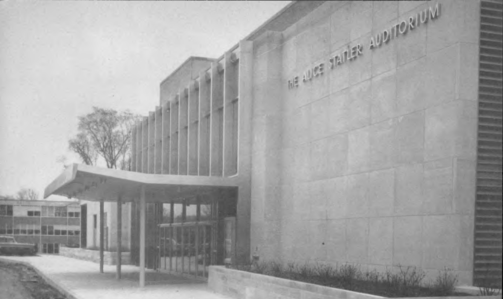
The Alice Statler Auditorium, a $2,300,000 addition to Statler Hall, provides, besides a 900-seat auditorium