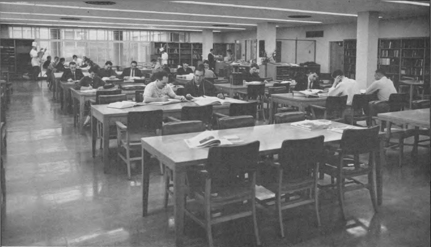
The School's library, directed by a full-time librarian, provides students and faculty with 11,000 books and periodicals on all aspects of hotel, motel, restaurant, and institution operation.