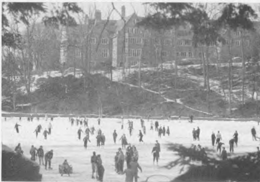
Skating on Beebe Lake below the women's dormitories. Figure skaters and hockey players prefer the artificial ice rink in Lynah Hall, where the hockey games are played.

activities, play on the teams, sing with the glee clubs, and act in student plays. Like other students, they may live in the dormitories, in fraternities or sororities, or in private homes.