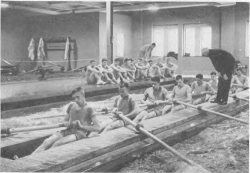
Winter drill for the crew in Teagle Hall.