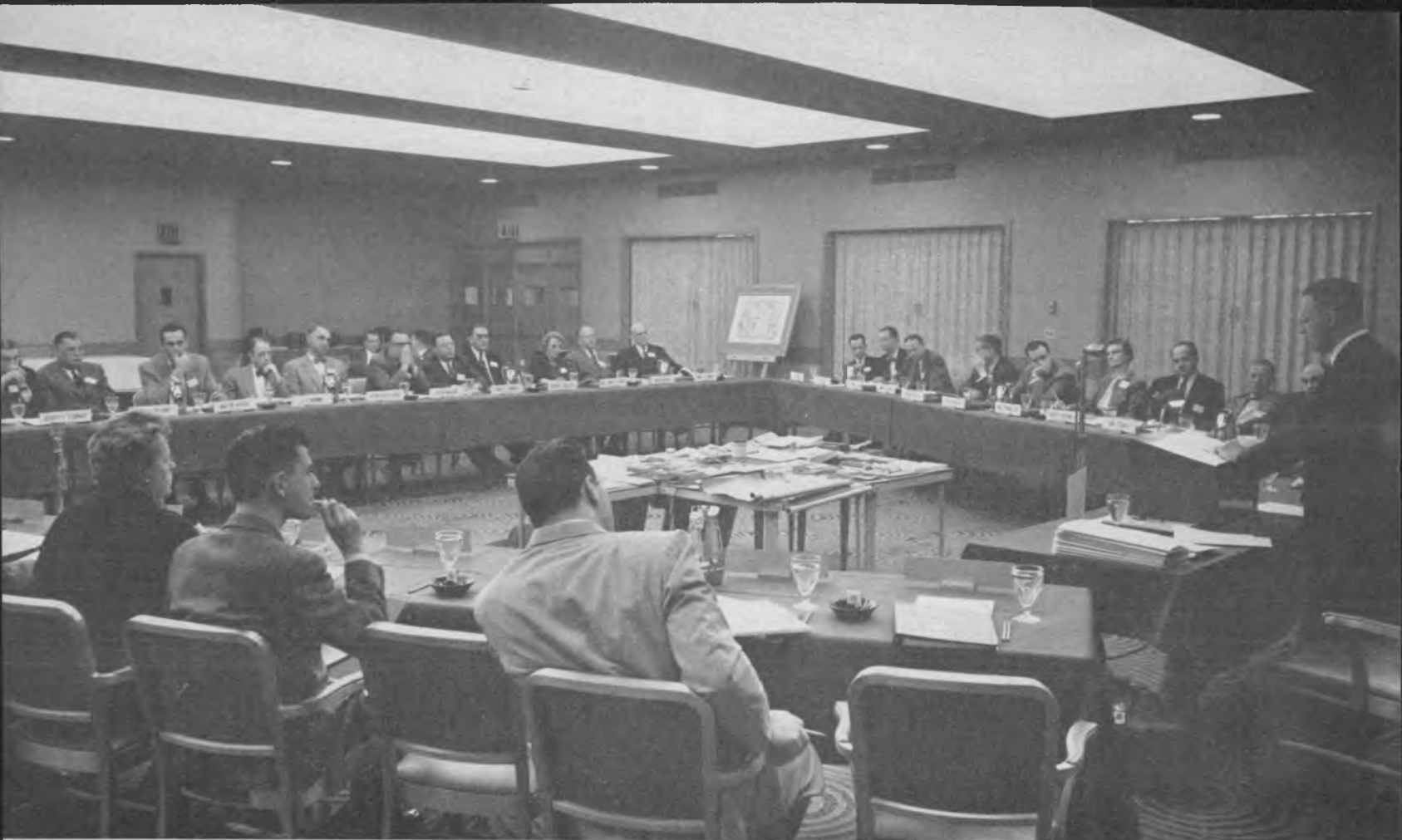
Workshops for hotel, club, and restaurant managers are held each year at the School of Hotel Administration. During the summer the School