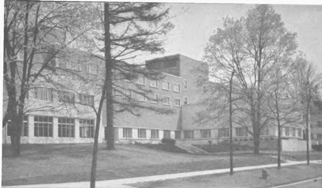
Statler Inn provides a practice laboratory for students in Hotel Administration.