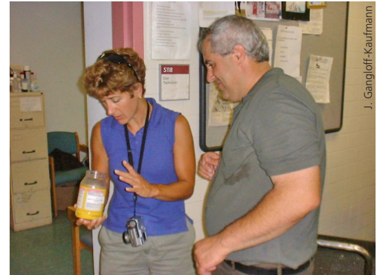
The IPM coordinator can raise awareness among employees and explain why IPM is important.

Other elements of a successful IPM plan include developing a site plan, inspecting and monitoring for pests, keeping records of pest and pest management activities, maintaining good communication and cooperation between the IPM coordinator and all parties, and evaluating the program annually. These and other topics are covered in additional fact sheets.