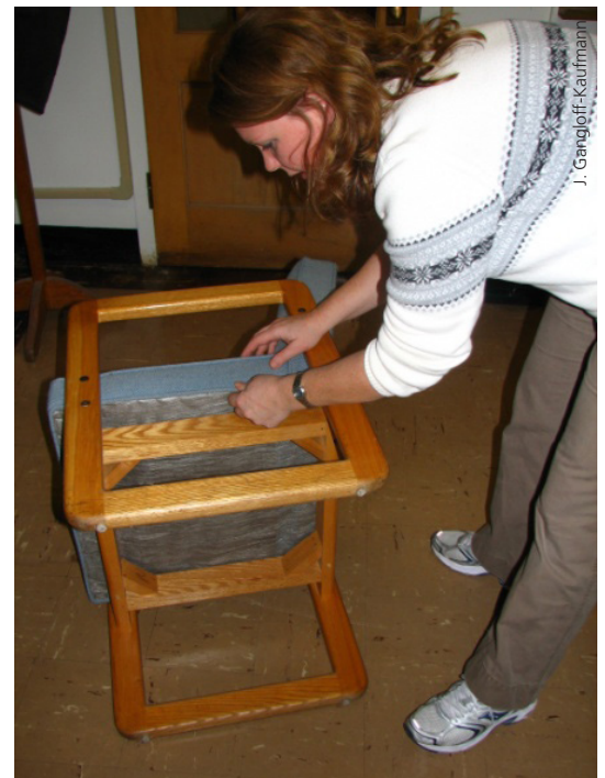
Inspection is the first step in pest control.