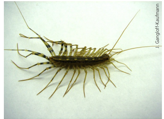
House centipedes are common in school and municipal buildings.