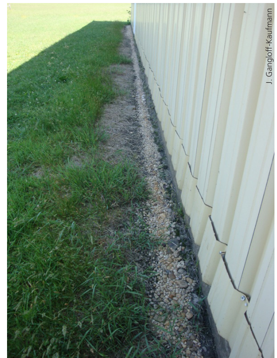
Simple modifications, like this gravel barrier around the building, can reduce pest activity inside.