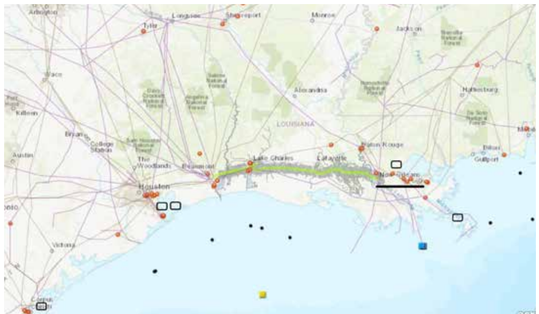
Figure 5. U.S. Gulf Coast map shows refineries indicated by orange dots, new terminals indicated by black squares, LOOP indicated by blue square, and pipeline network including Bayou Bridge Pipeline indicated by green line and proposed extension indicated by black line.

have originated from the U.S. Gulf Coast this year. Trafigura, a Swiss commodity trading company, through its subsidiary Texas Gulf Terminals, is planning on the construction of a mega-terminal located 12.7 miles off the coast of Corpus Christi to accommodate VLCCs for crude export. Sentinel Midstream also plans to accommodate VLCCs with the 85,000 barrel per day terminal Texas GulfLink. Enbridge Inc., Kinder Morgan and Oiltanking are collaborating and have secured sites to accommodate VLCCs as well as Enterprise Product Partners LP.