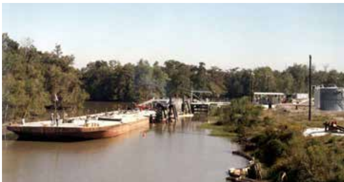
Figure 2. Barge in inland Louisiana waterway unloading crude into storage.

By providing an additional five feet of depth along the channel between the River's mouth and Baton Rouge, Federal and state government investment will allow New Panamax ships to reach four of the top performing 15 U.S. ports that handle, not only 60 percent of the nation's grain, but also connect to 14,500 miles of inland navigable waterways (Times Picayune, 2018). This type of investment is essential to U.S. logistics, including the transportation of energy. The growing business of logistics alone represents 10 percent to 15 percent of OECD economies as it continually places pressure on ports and surrounding industrial space to adapt