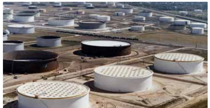
Figure 8. Crude oil storage in Nederland, Texas.