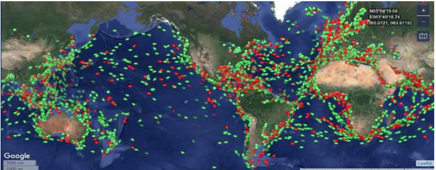
Figure 4. Global Ship Tracking from www.marinetraffic.com . Cargo vessels shown in green. Tankers shown in red.

(S&P Platts, 2018). Still, uncertainty has caused Chinese refineries to withdraw from purchasing U.S. crude. Despite this, Asia is still projected to increase its consumption of U.S. sweet and sour crude grades as countries such as India, Taiwan and Indonesia shift from energy producers such as Nigeria and Iran.