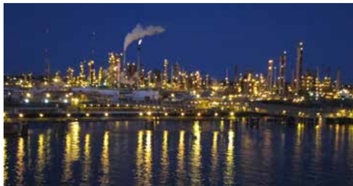
Figure 6. Louisiana refinery in St. Rose, Louisiana.

In addition to these announcements, the LNG industry is also announcing numerous refinery developments and export terminals on the Texas and Louisiana coasts. Meanwhile, as LOOP becomes the nation's top exporting facility, secondary and tertiary industrial infrastructure along the coast will be impacted. Most terminals have water access since transport by water and pipelines are the most cost effective. Trucks and tankers can be used for refined products, but transporting crude by rail is cost prohibitive and poses environmental risks. Because of this, prices are soaring on usable land due to speculation. Still, as capital flows into these areas, opportunities are becoming available to service the value and supply chains of the oil and gas industries. These places will need value added manufacturing sites such as pipe manufacturing facilities or break bulk terminals used to unload and warehouse individually handled cargo. Avondale Marine, a JV between Hilco Redevelopment Partners and T. Parker Host formed