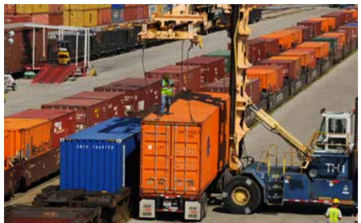
Figure 11. Containers loaded onto rail at the Port of New Orleans.