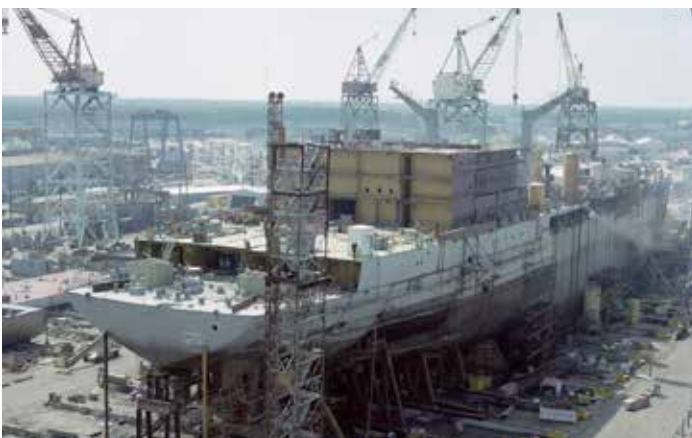
Figure 9. Elevated starboard quarter view of the commercial fleet oiler, USS Joshua Humphreys.