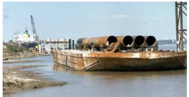
Figure 7. Barge unloads break bulk from nearby manufacturing facility.

During the 1940s, the shipyard began constructing vessels for the military through contracts awarded by the United States Maritime Commission, and later advanced to building larger military vessels such as destroyers and destroyer escorts throughout World War II and the Korean and Vietnam