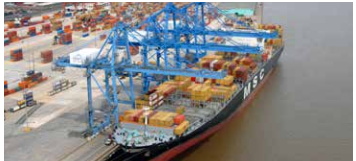
Figure 10. Container ship at the Port of New Orleans.

Despite the site's narrowness, opportunities exist to facilitate and expand the increasing container traffic on the Mississippi River. For example, The Port of New Orleans recently moved "more containers in 2018 than at any time in its history: 591,253 twenty-foot equivalent units (TEUs), up 12.3 percent compared to one year ago" and, in the same year, hosted the Pusan C. 9,500-TEU vessel, the largest container ship to ever call on the Port (American Shipper, 2019). The recent increase in volume can be attributed to port leadership putting emphasis on growing capacity. The takeover of the New Orleans Public Belt from the City of New Orleans by the State of Louisiana was also instrumental. The New Orleans Public Belt is served by six Class 1 railroads - BNSF, Canadian National, CSX, Kansas City Southern, Norfolk Southern, and Union Pacific - together comprising a network of over 132,000 miles of track.