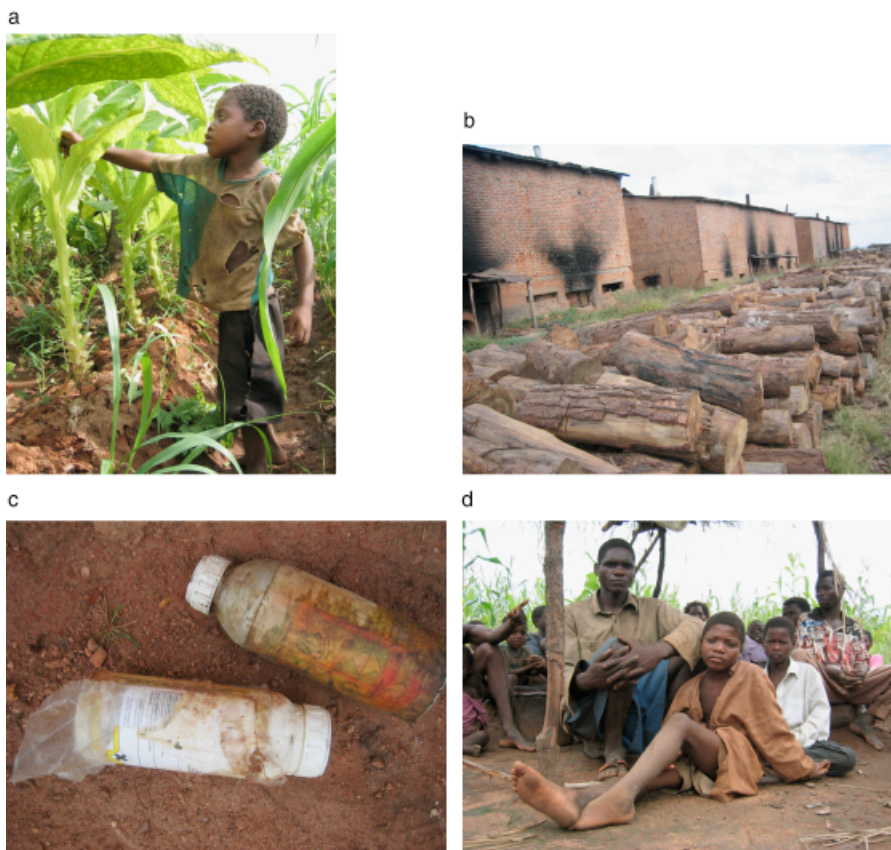
FIGURE 9. Images of the social, economic, and environmental consequences of tobacco farming in Malawi and other developing countries are strong counter messages to imagery in tobacco industry-produced videos about the benefits of tobacco farming. Parents send children as young as five years old to tobacco fields instead of school, preventing children from attaining an education (top, left). The image of tobacco-related deforestation informs viewers that tobacco degrades land and aggravates food insecurity through the farming of tobacco instead of less harmful export crops or food crops (top, right). Tobacco farmers and environments are vulnerable to poisoning from pesticides and fertilizers (bottom, left). Inflated costs for seeds and fertilizers and low tobacco prices paid by global tobacco companies contribute to farmer indebtedness to farm landlords and tobacco companies (bottom, right).

performed that prevent children from attending school. The child labor image shows the poverty pertaining to tobacco farming that is absent in industry-produced videos. The image informs viewers that tobacco companies benefit from unpaid child labor and that tobacco farming requires regulation. The image of two pesticide containers with tattered labels on dirt-covered ground signals the pesticide poisoning of farmers, agricultural chemical pollution of water tables, and depletion of soil nutrients from fertilizers and pesticides in tobacco farming. The pesticide containers, which appear to be discarded, are signs of the health and environmental effects of agricultural chemical use, and of tobacco as a socially damaging crop. The image of cut trees in piles next to tobacco flue-curing barns that consume wood for fuel elicits tobacco-related deforestation