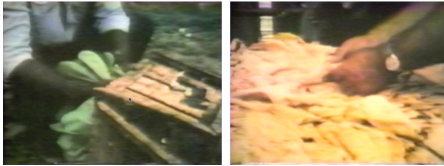
FIGURE 4. Still shots from Philip Morris's Tobacco: Seed to Pack . Hand labor of tobacco farm workers is used to load tobacco plants in drying containers (left) and inspect quality of dried tobacco (right).

positive foreign trade balance of more than $1.7 billion to our economy. That's symbolic of our tobacco industry. It contributes to America in a positive tangible way financially" (Philip Morris 1979).