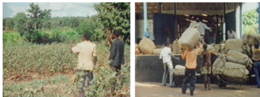
FIGURE 6. A British American Tobacco (BAT) Kenya agricultural extension worker and a tobacco farmer discuss land for BAT-funded reforestation schemes in Kenya (left). Tobacco workers unload tobacco bales at a storage depot in Kenya in a scene from BAT's BAT in the Developing World [Kenya] (1988) (right).

In the beginning of the sequence, the extension worker and farmer greet each other. The worker says, "How is the crop doing?" The tobacco farmer replies,