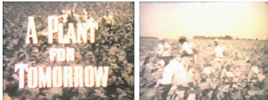
FIGURE 1. Title screenshot over a field of tobacco (left) and African American tobacco farm workers harvest tobacco (right) in still images from Lorillard Tobacco Company's A Plant for Tomorrow (1956).