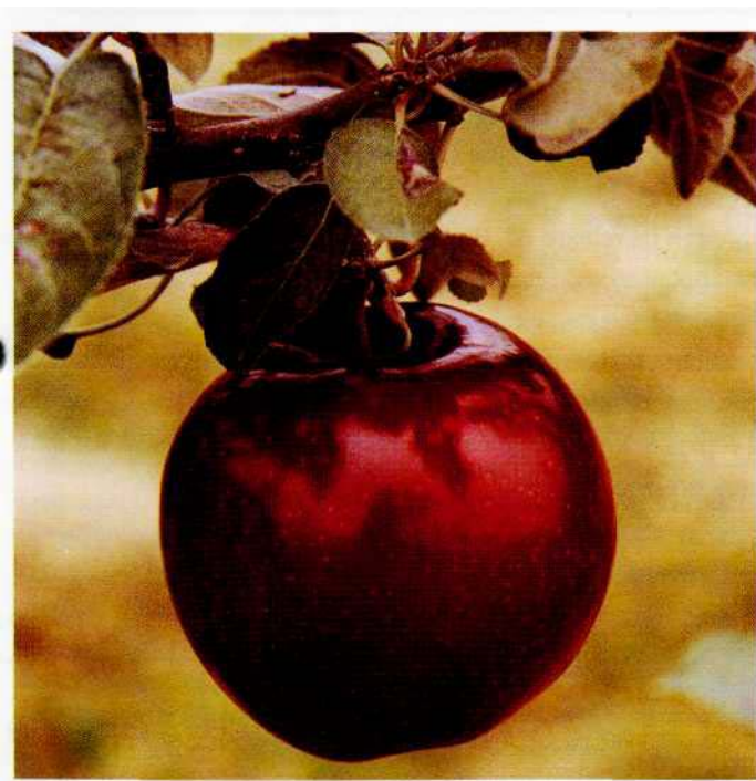
Figure 1. Fruit of 'Royal Empire'