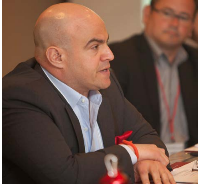
Joe Tagliente: Technology disruption occurs as consumers’ preferences and expectations change in response to changes in market technology.