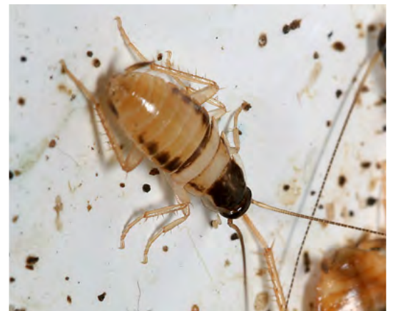
Brown-banded cockroach nymph resting inside a cupboard.