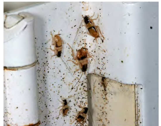
Brown-banded cockroach nymphs and fecal stains on a hinged door.