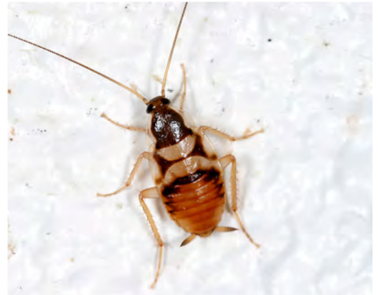
Brown-banded cockroach nymph.

In general, baiting systems have several advantages over traditional pesticides. Baits are typically semi-solid or solid products that confine active ingredients to small placements, therefore reducing pesticide use. In the case of cockroach control programs, a small amount of bait can have a large impact due to a phenomenon known as horizontal transfer. This occurs when cockroaches consume a lethal dose of a pesticide through the exchange of oral secretions containing the toxicant (emetophagy), when feces are consumed (coprophagy), or when a cockroach carcass is eaten (necrophagy). Baits do not work instantly, and some time may be needed before population numbers decrease. Note: bait avoidance can occur when pesticide sprays are