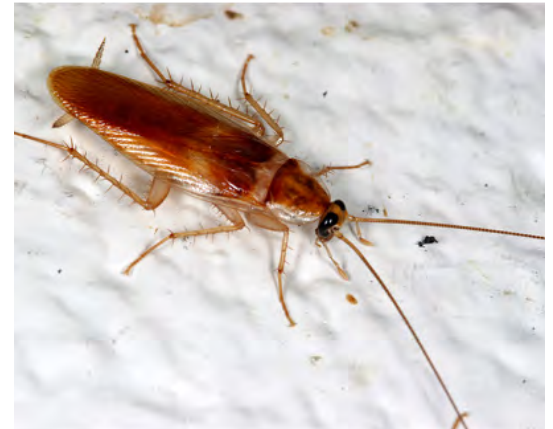
Brown-banded cockroach adult.

Brown-banded cockroaches ( Supella longipalpa ) are similar in size and shape to German cockroaches ( Blattella germanica ), but differ in their markings and, more importantly, in their preferred habitat. Brown-banded cockroaches prefer warm, high, and dry places; German cockroaches live in moist areas (bathroom and kitchen sinks, refrigerators). As a result, the brown-banded cockroach can be found throughout a living space, making inspection and treatment for this pest unique. Additionally, because brown-banded cockroaches are found in rooms other than the kitchen, exposure to cockroach allergens is often higher for this pest. While this cockroach is not common in the Northeast, they are easily introduced on furniture and other transported items.