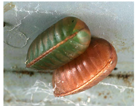
These two egg cases, or ootheca, each contain 16 eggs.