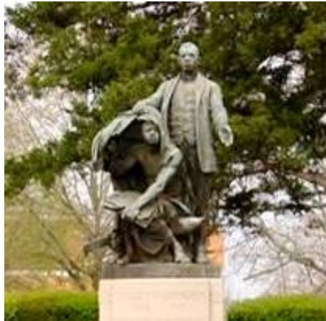
"Lifting the Veil", A statue in honor of Booker T. Washington

When I visited Tuskegee as chair of the Council on Education review team for the veterinary college a little over a decade ago, I was deeply moved by the majestic statue of Washington embracing a slave child. The statue is fittingly and lovingly called, "Lifting the Veil", a tribute to Washington's commitment to exchanging the cover of ignorance with the transforming power of education. You almost feel like you are walking on hallowed ground when you tread on the grass around the statue, and approach the nearby chapel and cemetery where Washington's body rests.