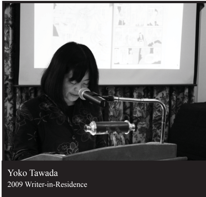
Yoko Tawada 2009 Writer-in-Residence

the basic structure of the language’s syntax. He further asked whether the “ideography serves to order and classify the confusing Japanese syntax” and to illustrate that it is impossible to define what is Japanese without “foreignness.” Sakai then returned to Tawada’s example of the gate trope in order to clarify his idea of the indeterminacy of national languages, that “it is impossible to find unity of language just in words; you have to look at syntax” and that the “belonging of a word to a specific language has to be found in upper levels of syntax.” He emphasized that the unity of national language is “fabricated while still remaining part and parcel of cultural contexts.” It cannot be an “empirical unity” and this has “implications for other categories such as translation.” (Grace Gemmell)