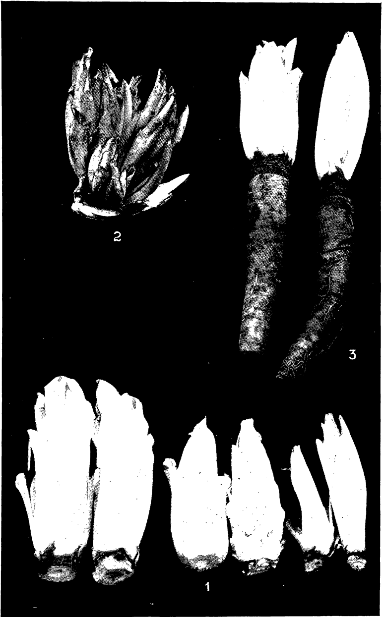
PLATE II.— WITLOOF CHICORY HEADS.

1, Heads from roots shown in Plate I; left, too large; center, ideal; right, too small; 2, compound head; 3, forced roots, with crowns and heads.