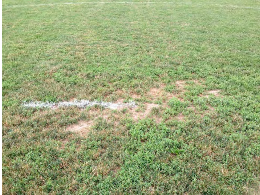
Typical condition in Areas of Concentrated Play (ACP) with heavily compacted soil conditions, bare or thinned turf areas, and intrusion of prostrate knotweed and broadleaf plantain.

A soil probe was used to gather soil samples. The probe also provided some measure of the workability of the soil. The sideline areas on all fields except Field #3, could easily probe 4-6 inches deep. Center zones were typically 2-3 inches deep. The northeast corner of Field #3 and all along the northern sideline was 1-2” depth. A double ring infiltrometer was used to measure saturated infiltration rates in the outer sideline and within the Areas of Concentrated Play (ACP).