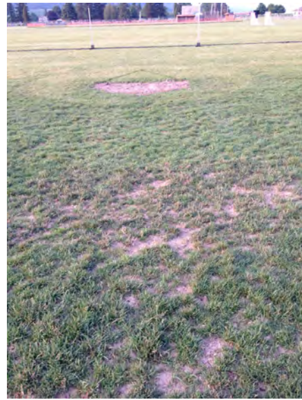
Wear within the 12 meter arc's around the goals