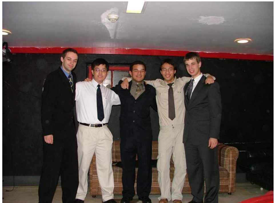
2005 Fall Pledges

I sense that this pledge class will have great unity because all of them are easy going and sincere. Even though, they have only been pledges for a few days, I can already tell that they will be a great match for Acacia, as they are very inquisitive about the structure and organization of the house. Let's just hope that they don't lose their pledge pins on the second week of the pledge program!