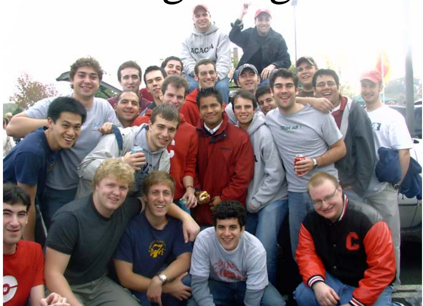
Homecoming Tailgate 2005