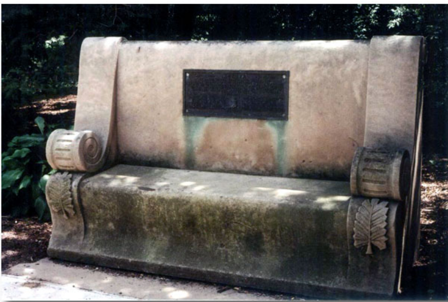
25th Anniversary Bench at the University of Michigan

It is a great thing to have something that will remain on campus as an anchor even fifty years after your final departure. Buildings on campus rise and fall. Professors enter and retire with the coming of time. Northcote, our home, will hopefully remain as a steadfast landmark