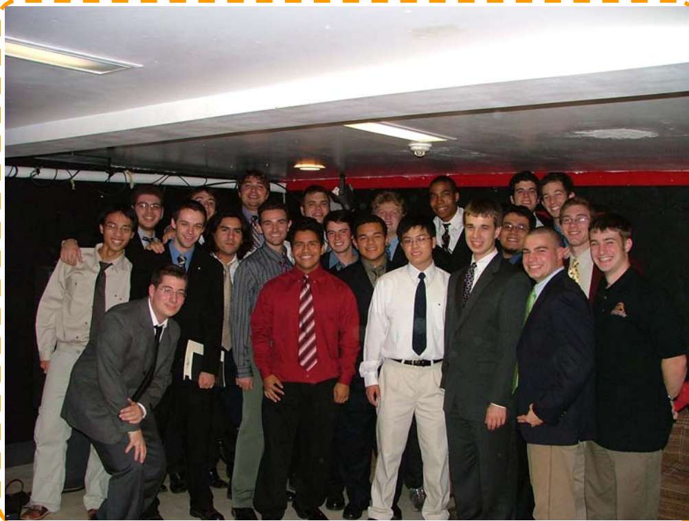
Pledge Induction Fall 2005