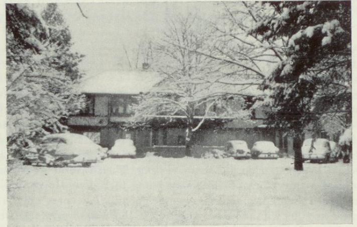
Northcote, front view, December 1950