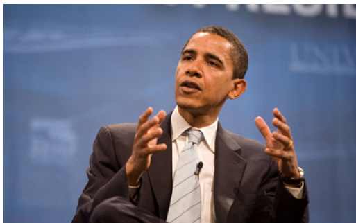
President Barack Obama speaking without a flag pin.

A year after Rau’s death, in America, Barack Obama faced criticism for not wearing an American flag pin on his lapel during the Democratic primary. In similarity to Rau’s controversial statement, Obama’s critics said that his lack of patriotism made him unfit for office.