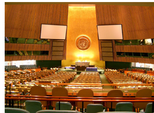
United Nations General Assembly

The United States' unilateral act was a dangerous precedent because it challenged the UN's authority with regards to international law: it made it so that other nations can use the Iraq war as an exemplar for why they should be able to