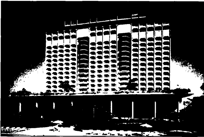
The Taj Group's Taj Mahal Hotel in New Delhi—a showpiece of the nation's arts, crafts, and traditions—was built for less than half the cost of a luxury property in the United States. The modest cost of building materials and labor in India compensated for the expense of securing the authentic artwork that graces the property.

tives from national and state government agencies. With the potential tourist market for India having barely been scratched, the government is now taking a proactive approach to increasing tourism. Some of the steps taken by the government to encourage the tourism industry include the following: allowing foreign-flag airlines to operate charter flights to six Indian locations, granting permission to the industry to import luxury coaches and cars, and establishing a permanent subcommittee for tourism to monitor the effects of government policy and the industry's performance. Foreign hotel operators are now allowed to hold substantial equity in their ventures in India, and the government is providing low interest rates and tax concessions for hotel investors. 1