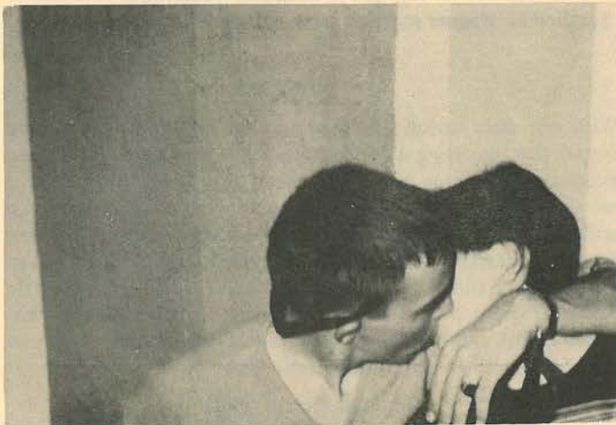
Results of Painting Contest? Who Won?

A piece of trivia that I learned was that there had been a painting contest in the recreation room for the sororities. I've forgotten who won. Rush was also different; there was no contact between freshmen and fraternity upperclassmen during the fall semester, only in the spring.