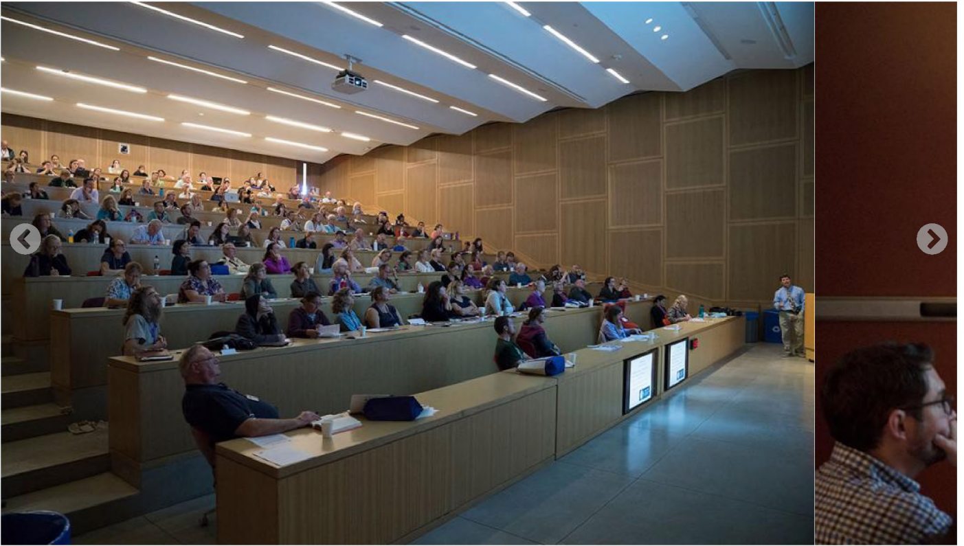
Clinical Investigator's Day 2018