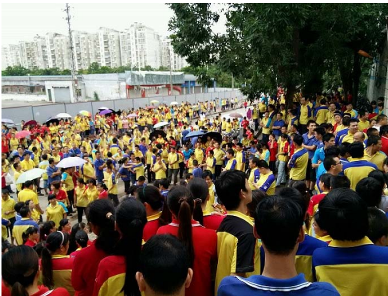
Striking Shenzhen Workers