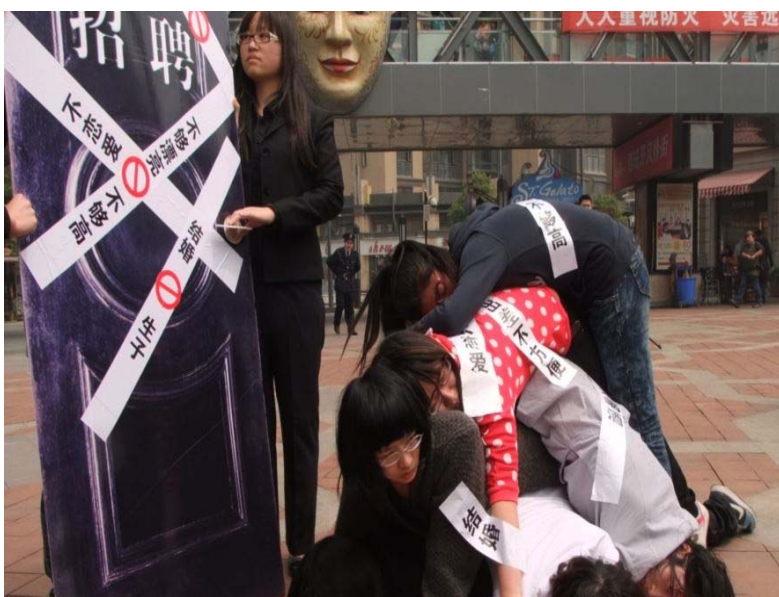
Female College Students Protest Against Hiring Discrimination